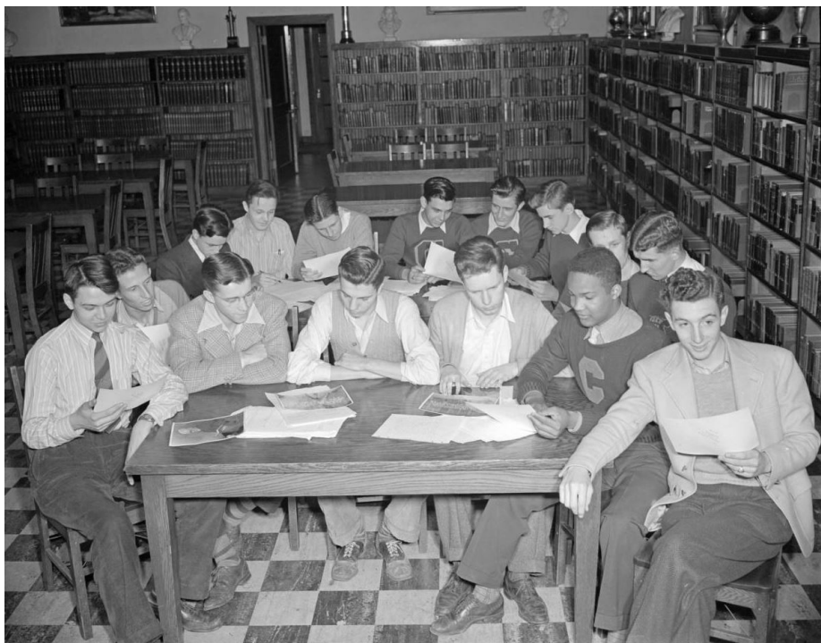
Boys in Cathedral High School Library