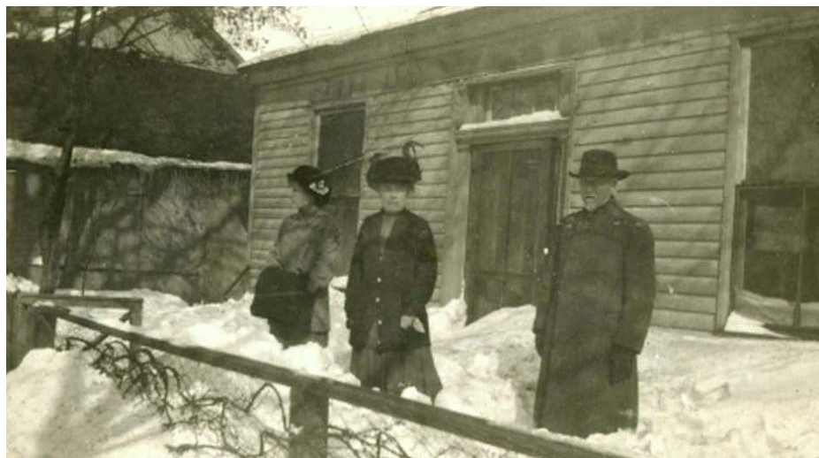
Knee-Deep in Snow