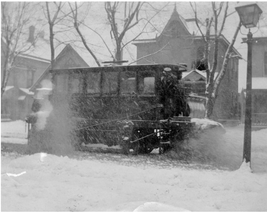
Snow Plow in Action