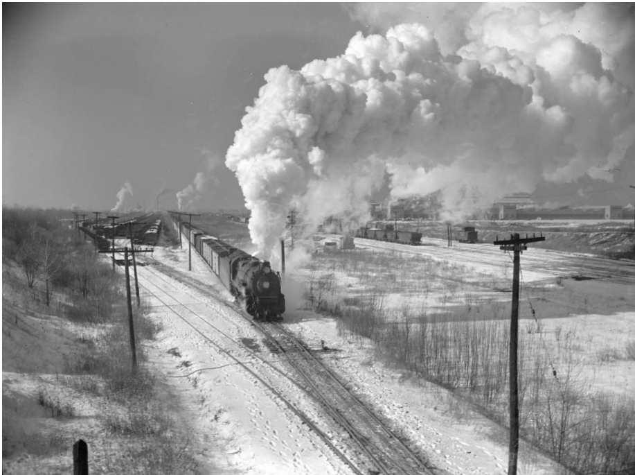
Railroad Freight Yard