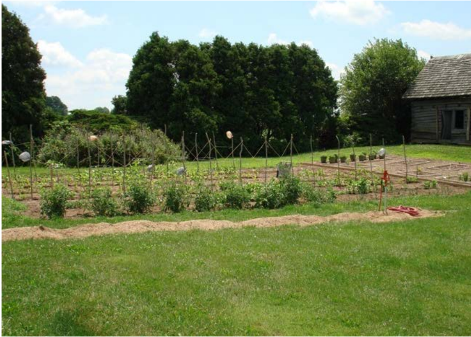
The Henry Breeding Farm historic gardens.