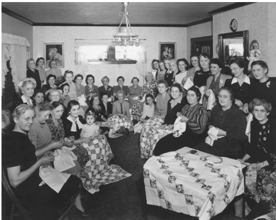
Daughters of the Nile Sewing Group