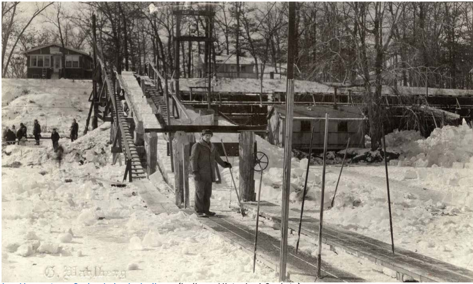
Ice Harvest on Cedar Lake in Indiana