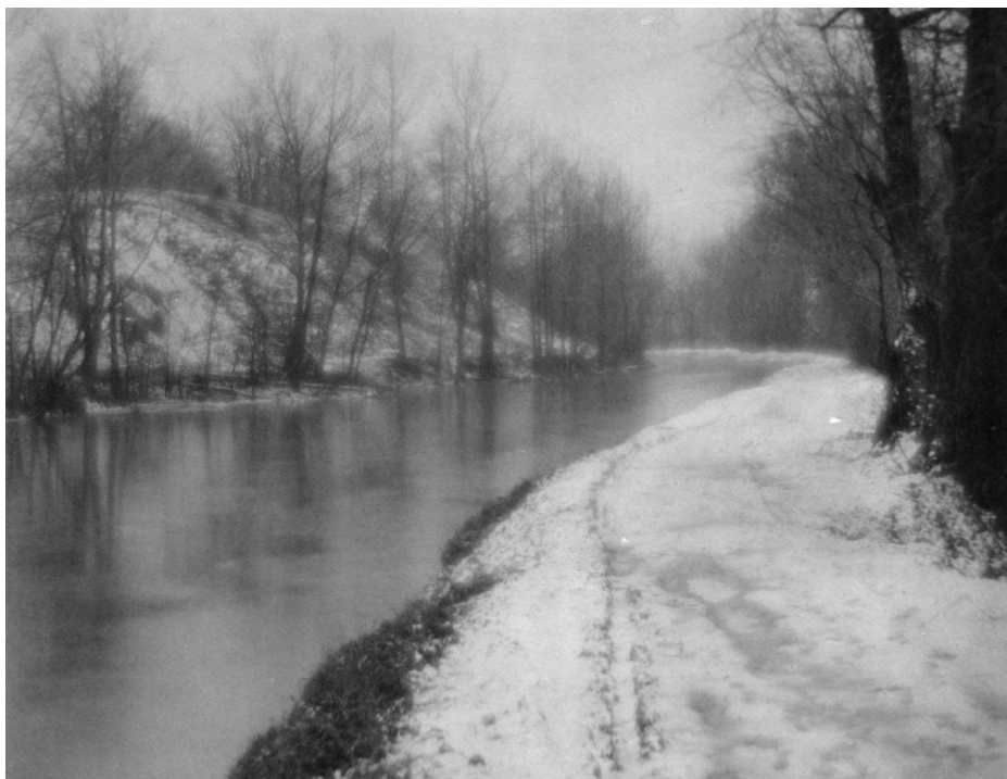
Snowy Scene [view of canal]