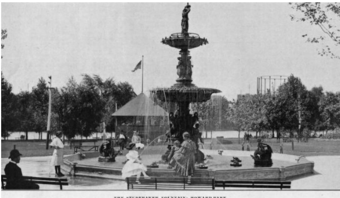
Studebaker Fountain: Howard Park, 1919