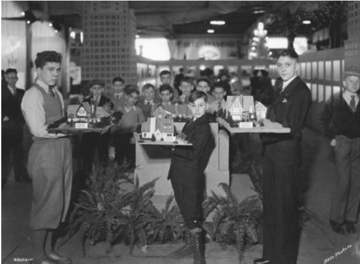
Boys Holding Miniature Houses, 1931