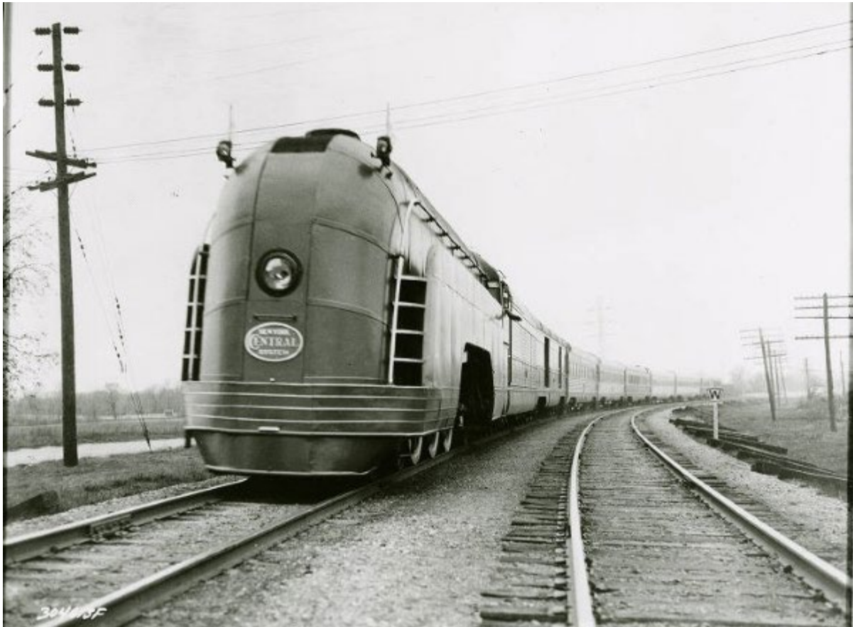
New York Central railroad engine. undated