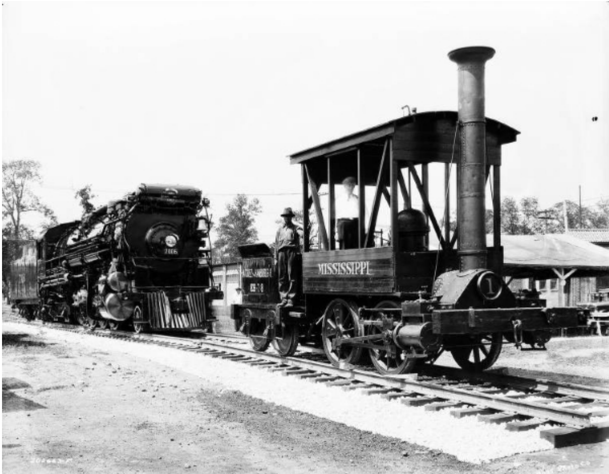
Locomotive Engines, 1927