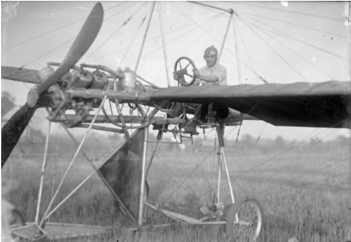
Johnson Brothers Airplane, ca. 1900-1920