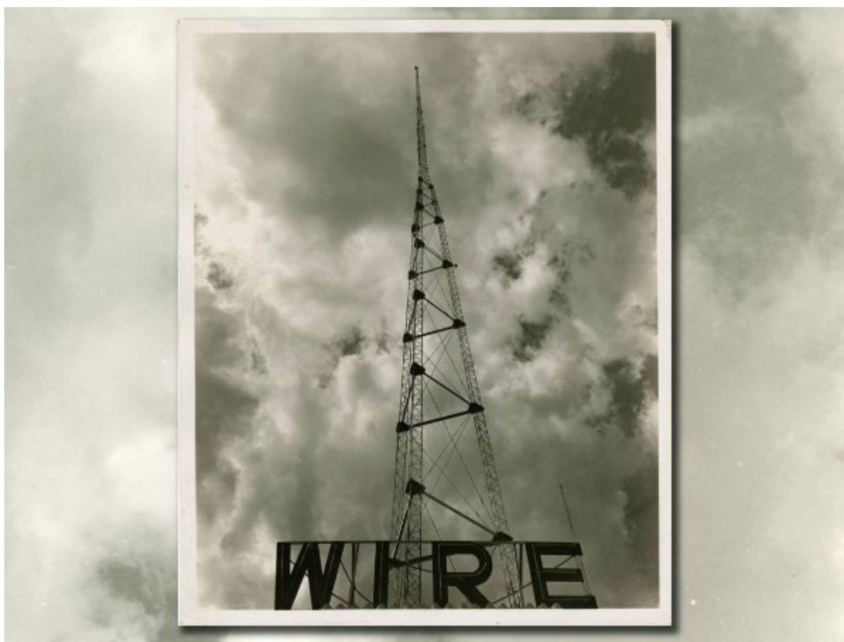
WIRE Radio Station Tower, 1937