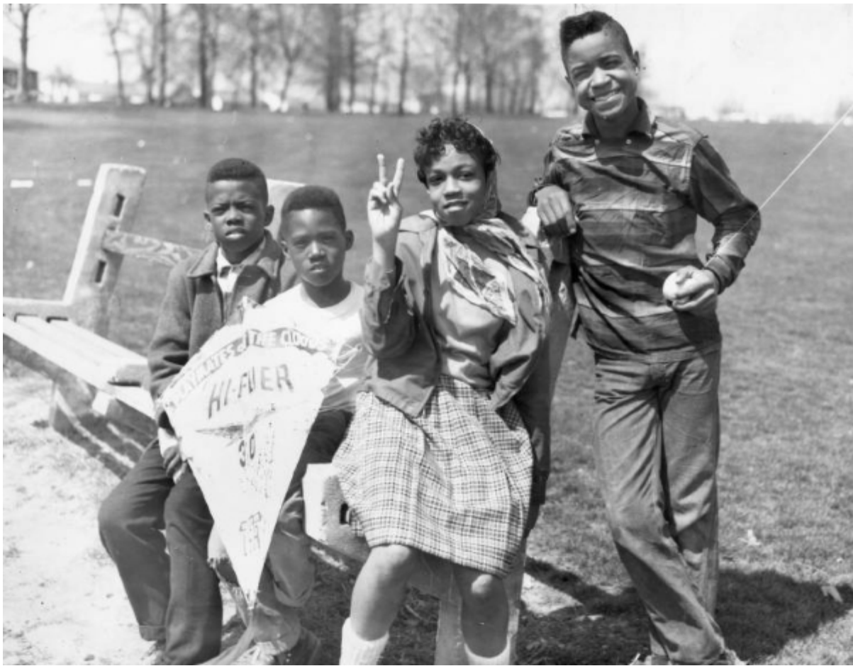
Carrier Kite Contestants, ca. 1970