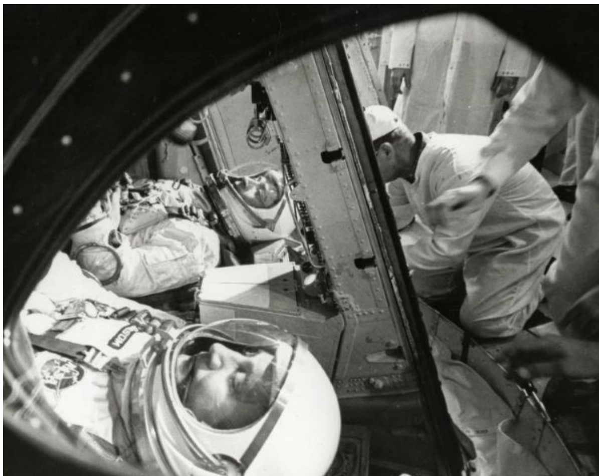
Grissom and Young Gemini Mission, 1965