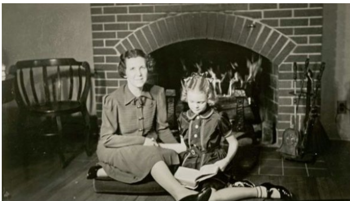
Unidentified Photographs, undated