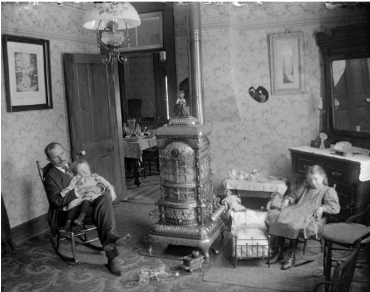
Family Sitting Around Heat Stove. ca. 1900