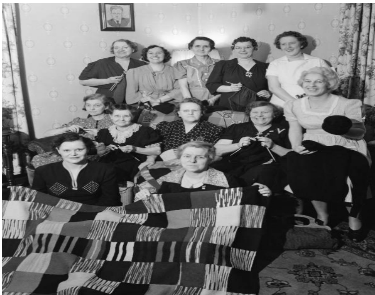
Navy Mothers Group with Knitting. 1943