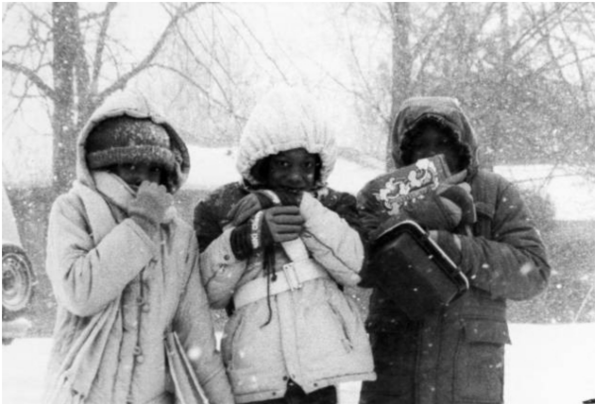
Winter Weather, 1985