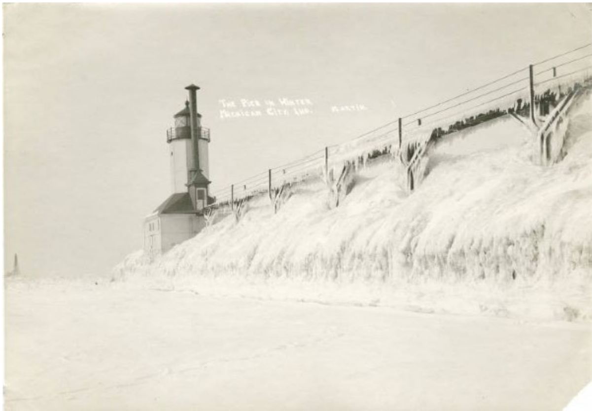
The Pier in Winter. undated