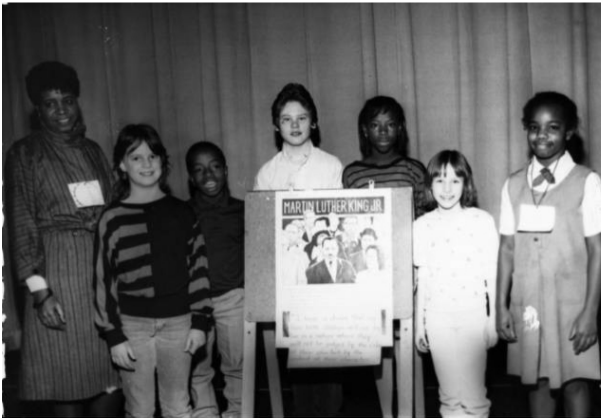
Martin Luther King, Jr. Day at School 26, 1985