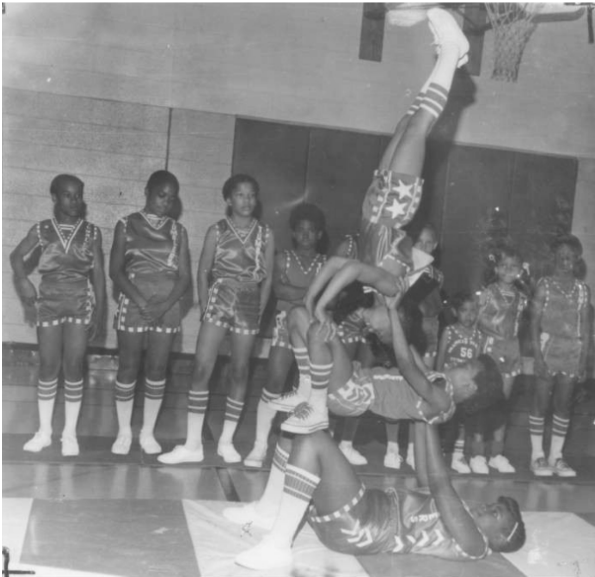
Tumbling Team at Francis W. Parker School 56, 1981