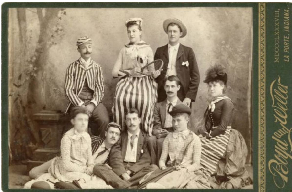
Tennis Players. 1888