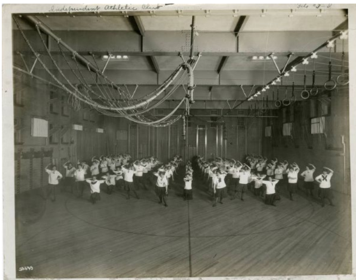
Exercise Class at the Independent Turnverein , 1914