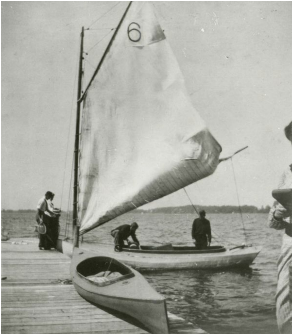
Sailboat on Lake Maxinkuckee. 1905