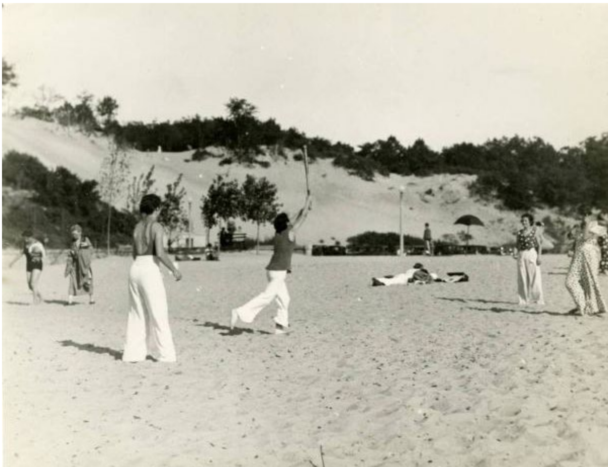
Women at the Beach, ca. 1938