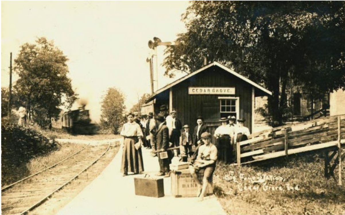
Big Four Station, Cedar Grove, Indiana, 1909