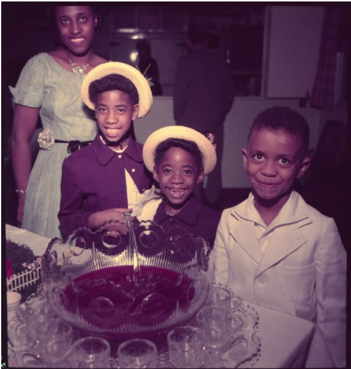
Children at a punch bowl, 1956