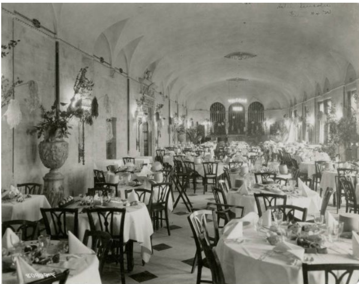
Hotel Lincoln, interior, 1922