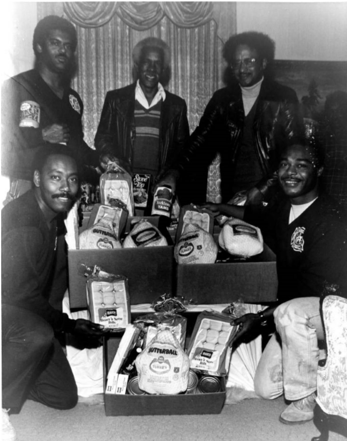
Spreading Goodwill, 1983