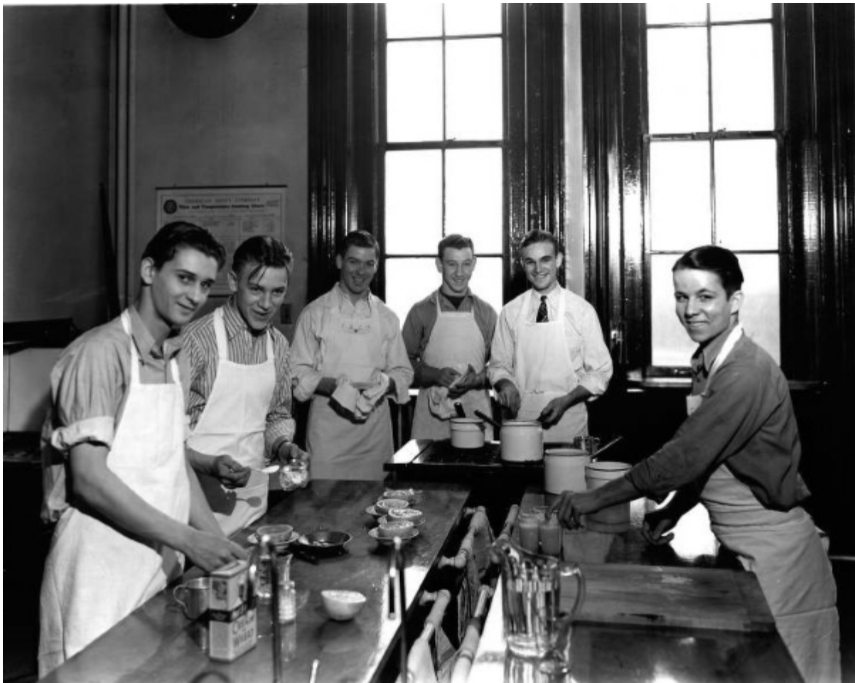
Boys Cooking Class at Gerstmeier School. 1941