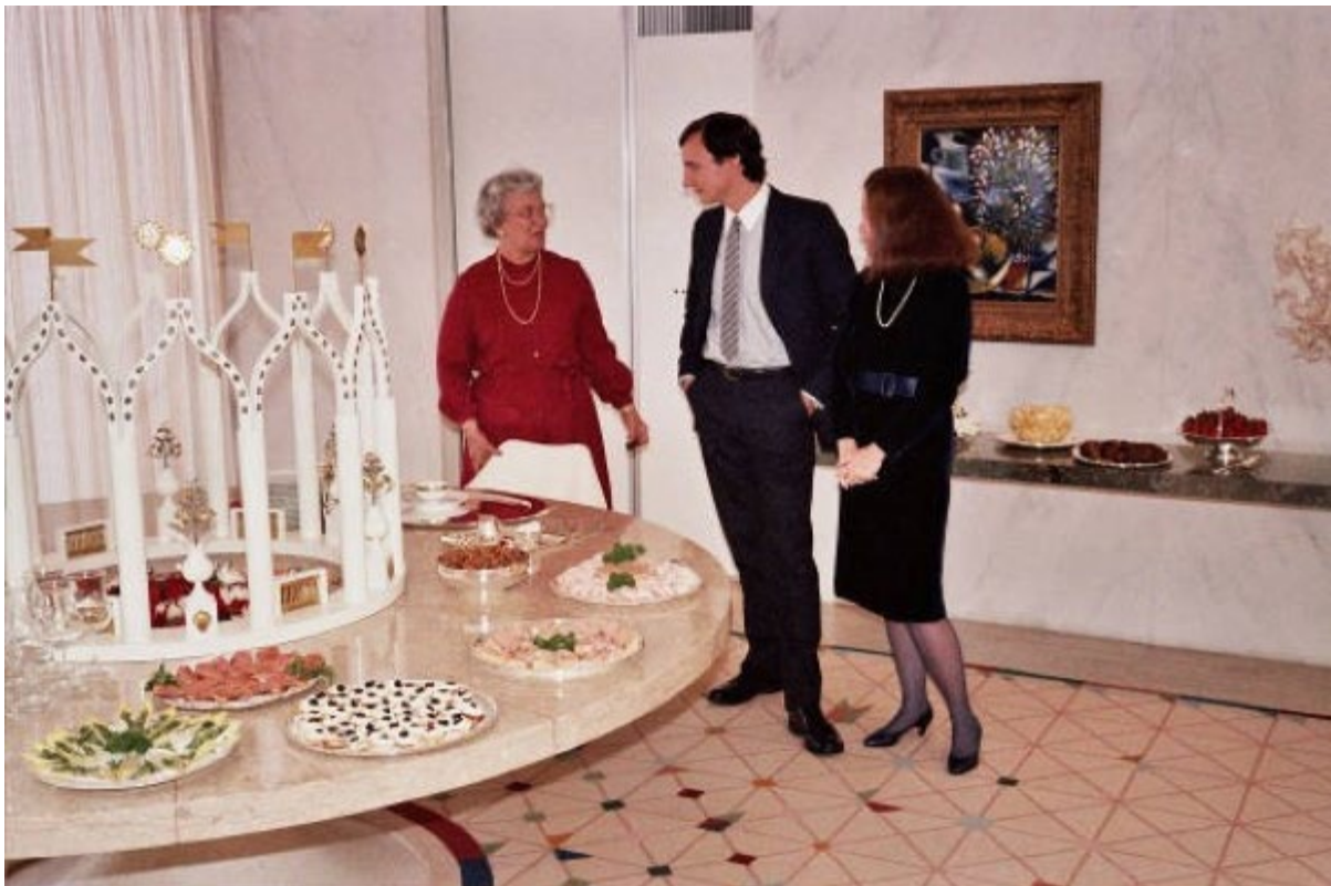
Holiday Hors D'oeuvres at the Miller House, 1984