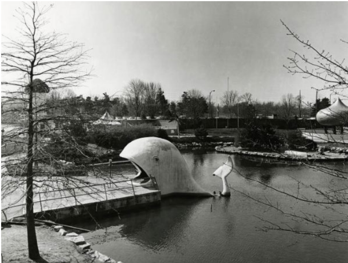
3120 East 30th Street. ca. 1970s-80s (City of Indianapolis, Department of Metropolitan Development, Indiana Historical Society)