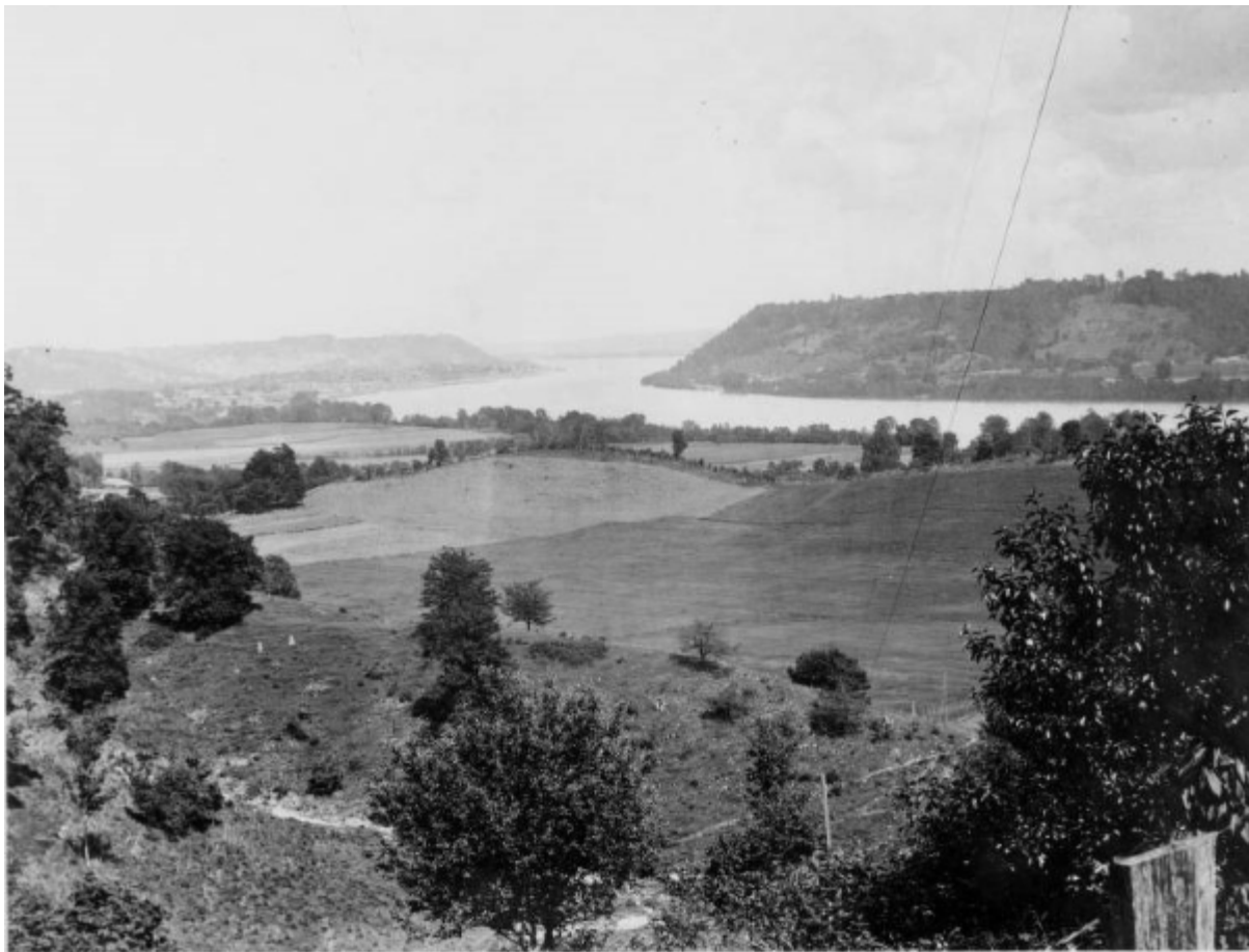
Ohio River from Hanover Road. 1892