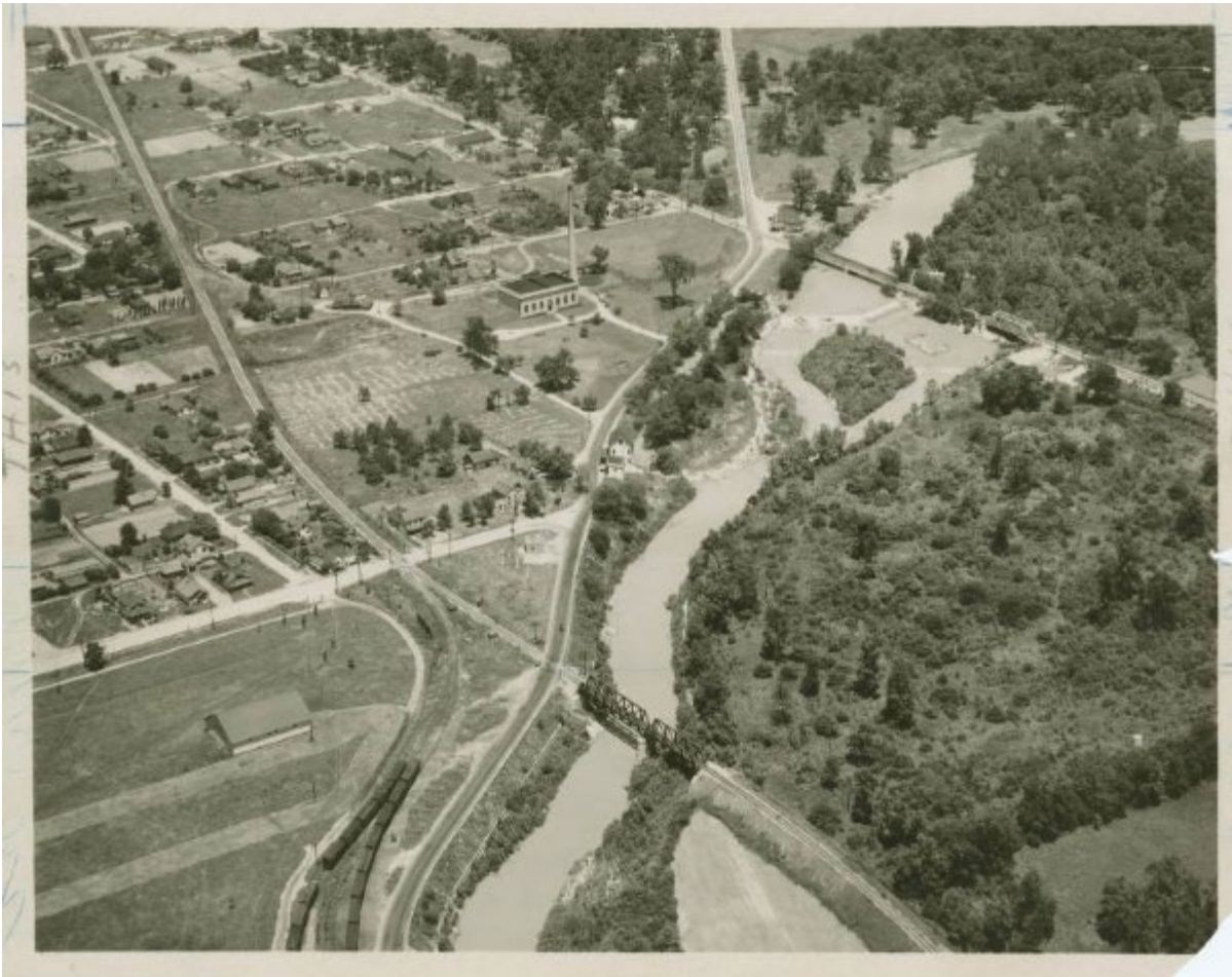
Fall Creek Station Aerial, ca. 1940s