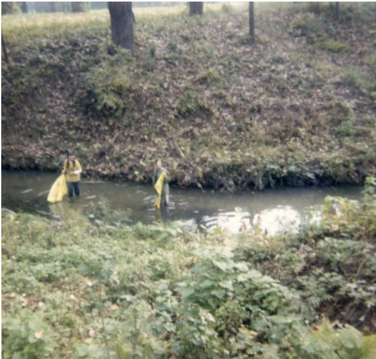
Girl Scouts Cleaning out a Stream, ca. 1971