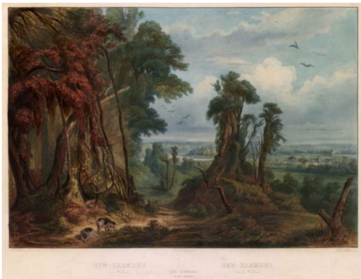
New Harmony on the Wabash, 1839