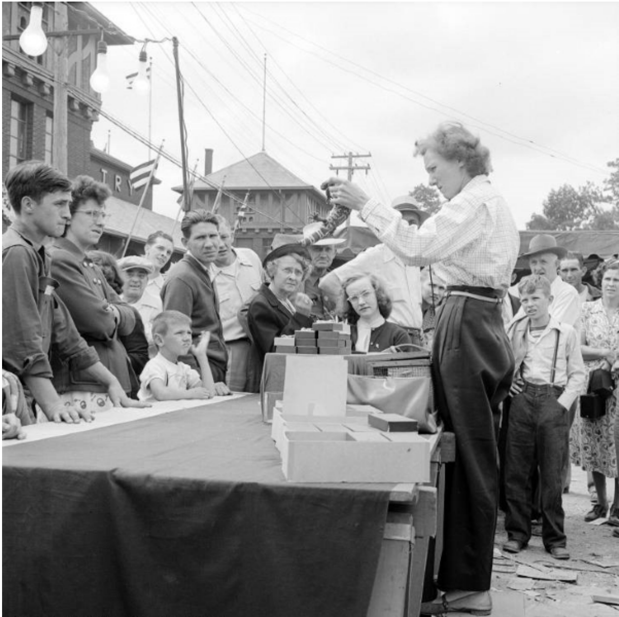
Woman Shows Gila Muster at Indiana State Fair, 1951