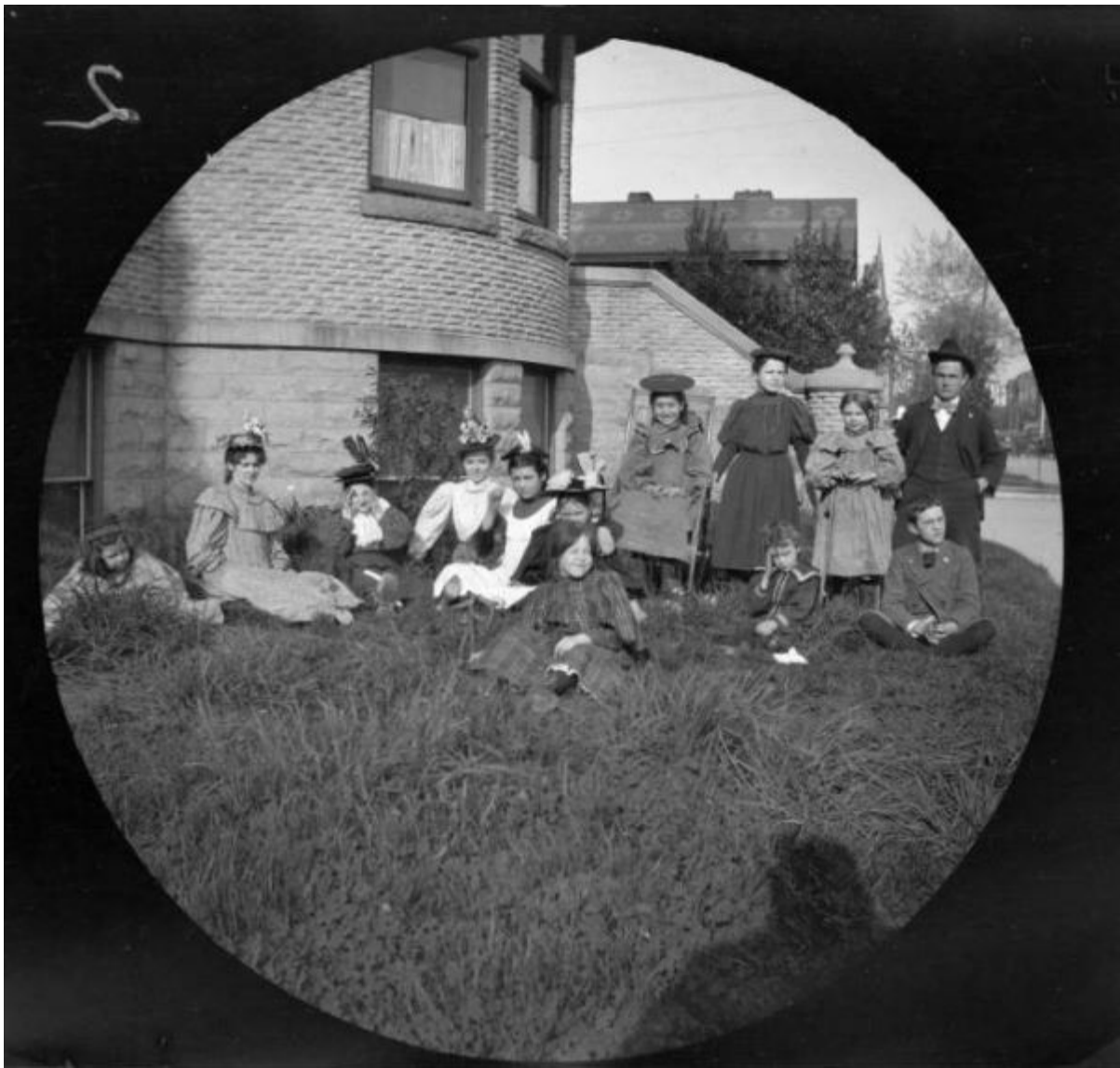
Nursery Children on the Lawn of the National Surgical Institute. ca. 1890s