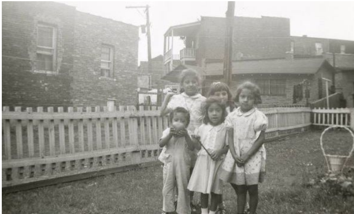
Five Children in Back Yard, ca. 1950