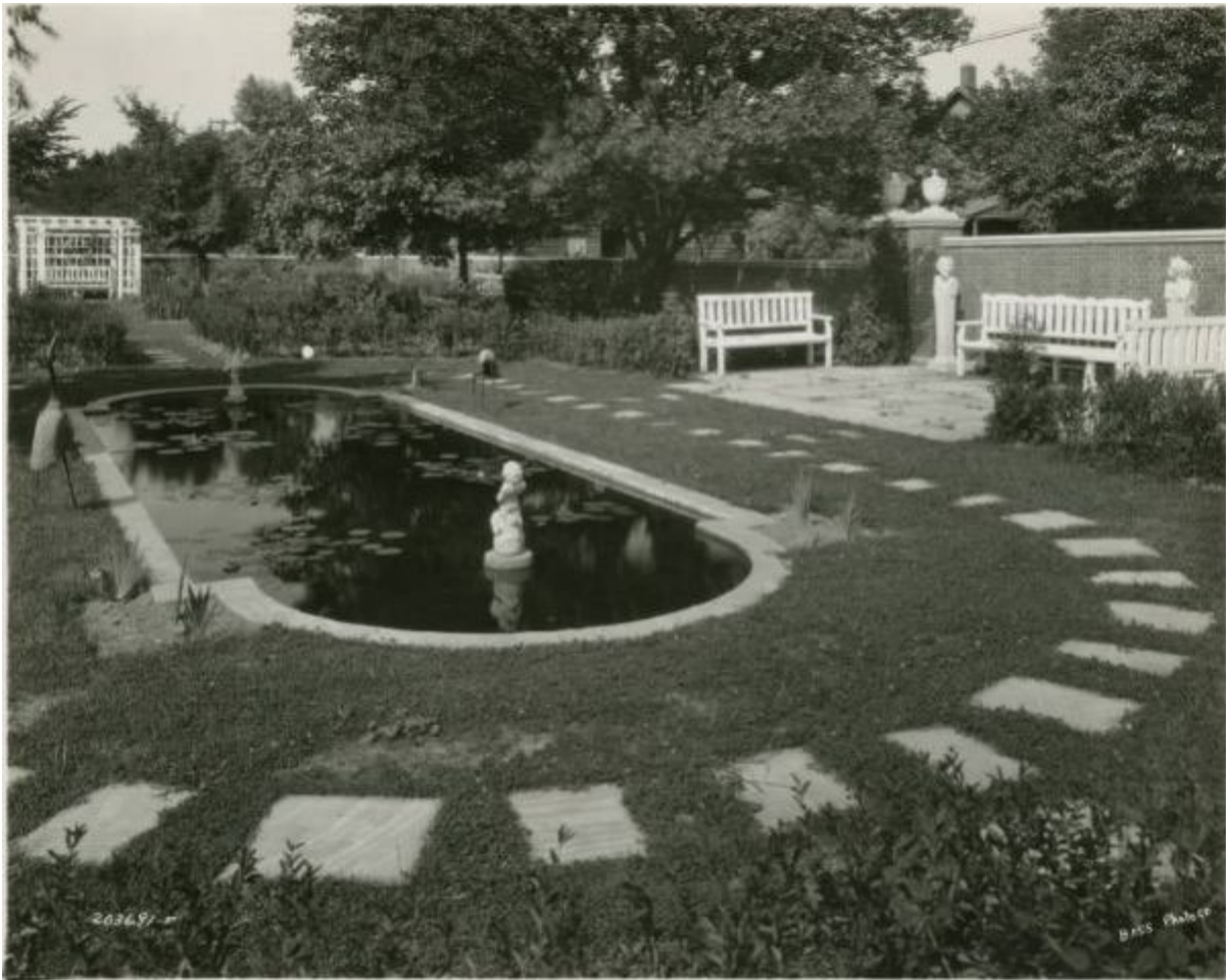
Roy E. Adams garden. 4145 North Washington Boulevard. 1927