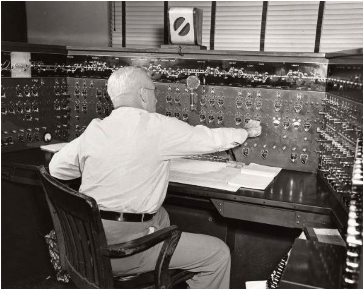
Nickel Plate Railroad Switchboard Controller, ca. 1940