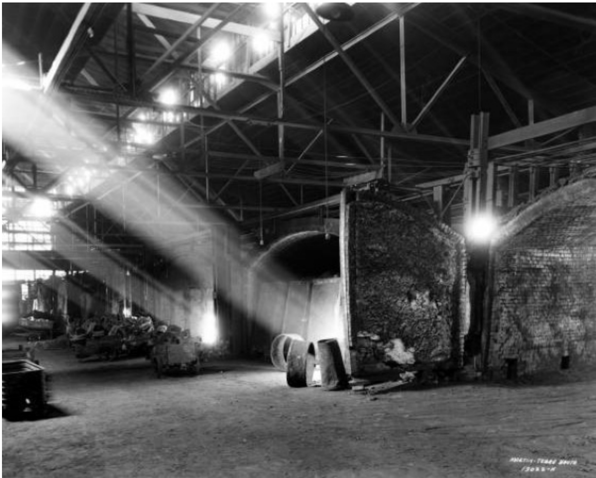
Terre Haute Malleable Company - View of the Plant, 1937