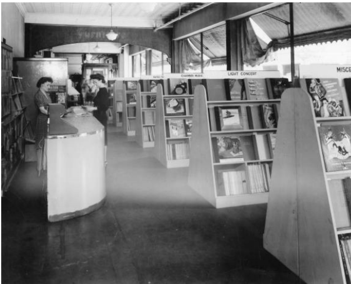
Root Store Record Department, 1944