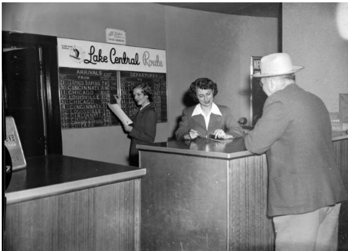
Lake Central Airlines. 1951