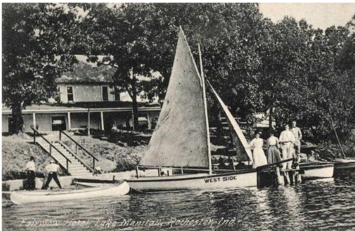
Fairview Hotel, Lake Manitou, [sic] Rochester, Indiana, ca. 1910