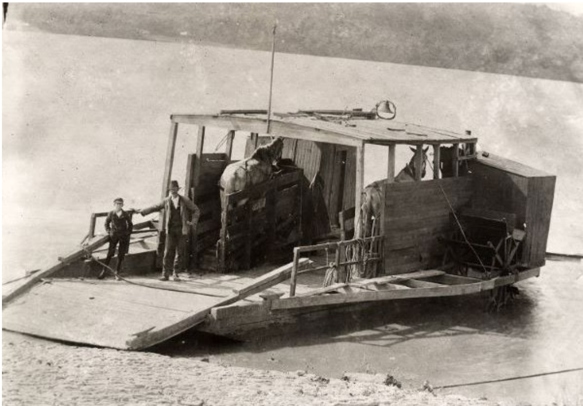
Ferry on the Ohio River. ca. 1885-1895