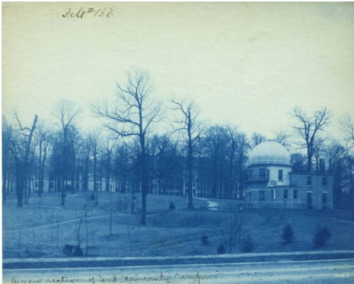
Indiana University, campus and Kirkwood Observatory, 1904