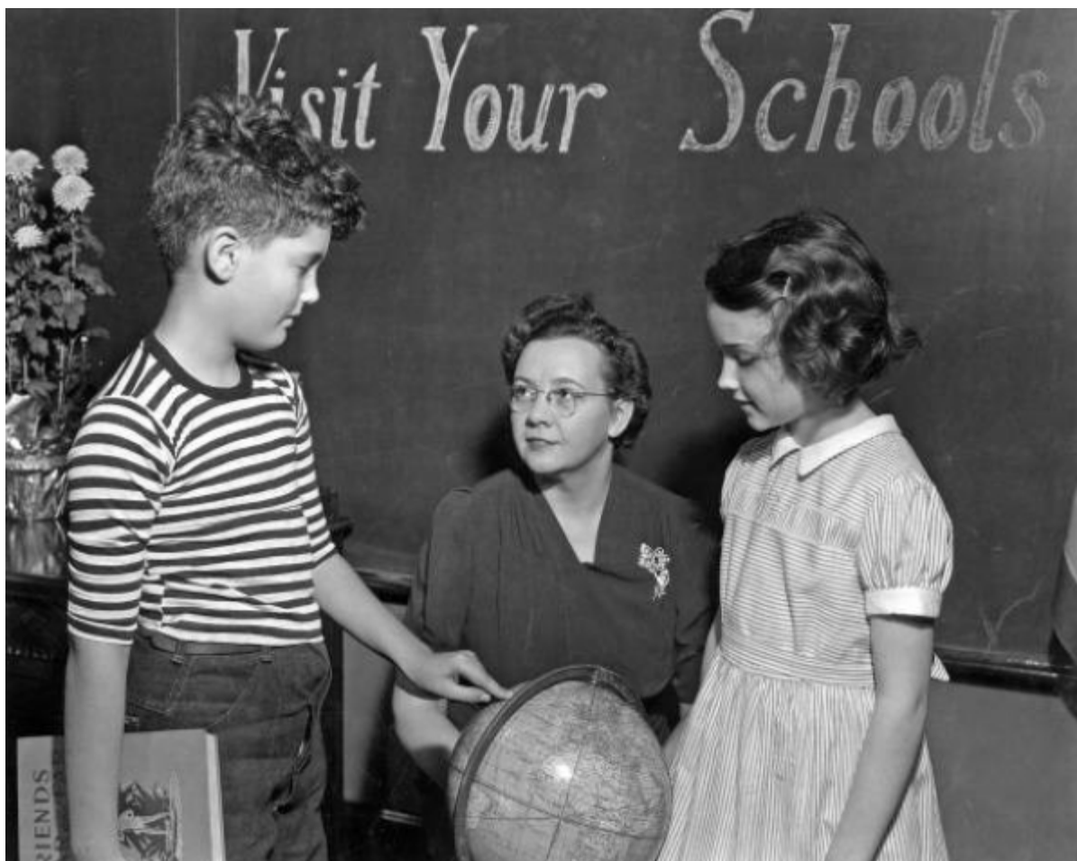
Fairbanks School-Children Teacher and Globe, 1944