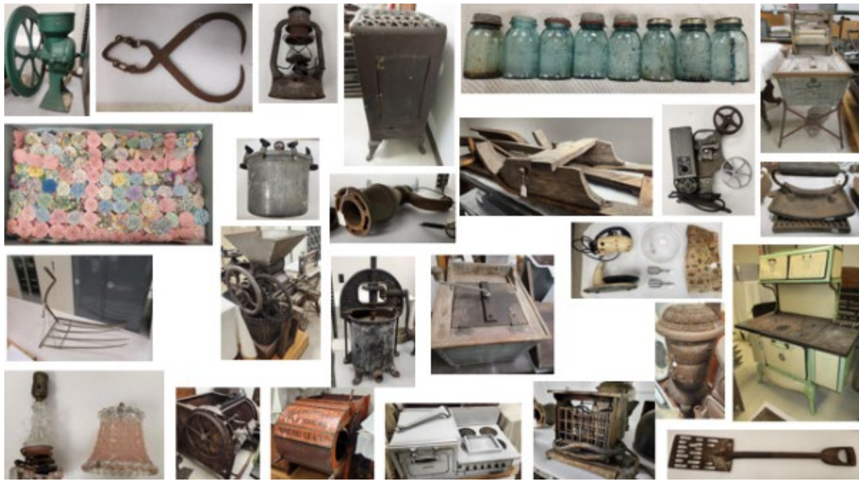
A sample selection of the objects that may be available

Indiana Dunes National Park recently reviewed objects from its museum collection, and is in the process of deaccessioning objects that are outside the park's museum scope of collection.