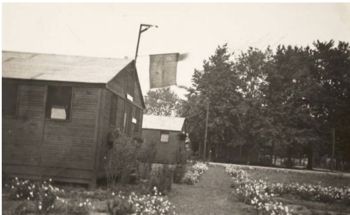
Flowers at CCC Camp, ca. 1938