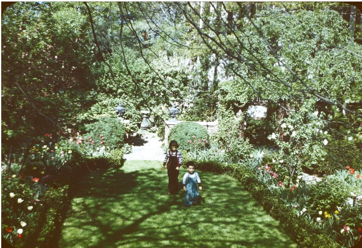
Gardens at Home and Abroad. Slides. ca. 1940s-1950s