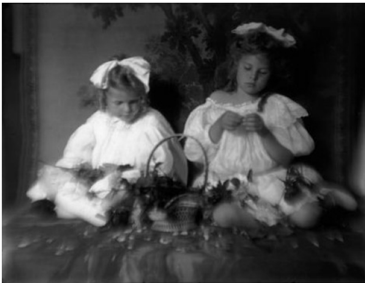
Girls with a Flower Basket, ca. 1900-1930