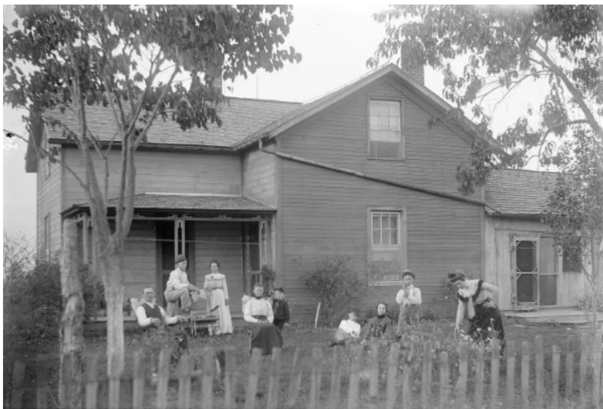
Family of Nine Posed in Front of their Home. ca. 1900