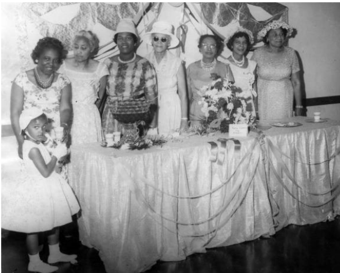
Flanner House Guild Tea, 1962