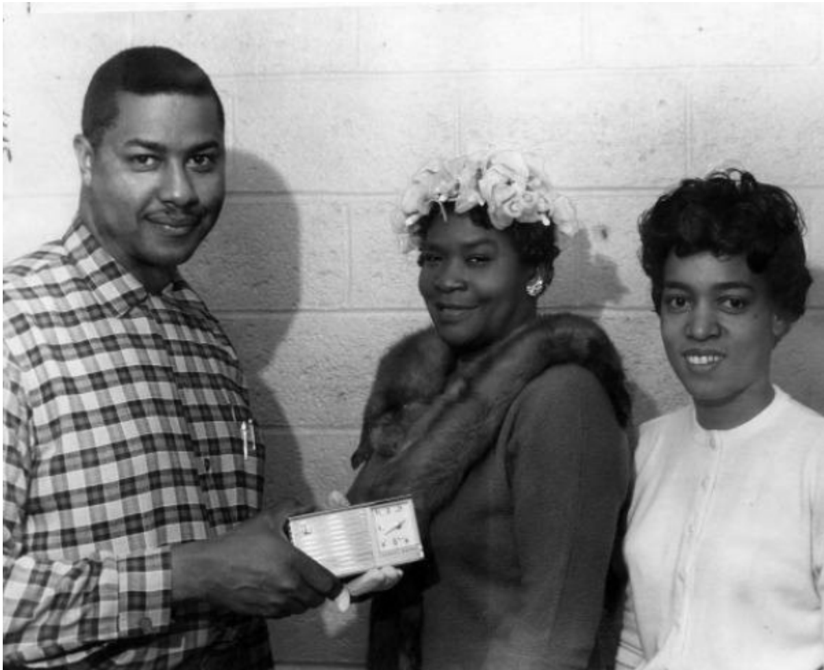
Clock Presentation. n.d.