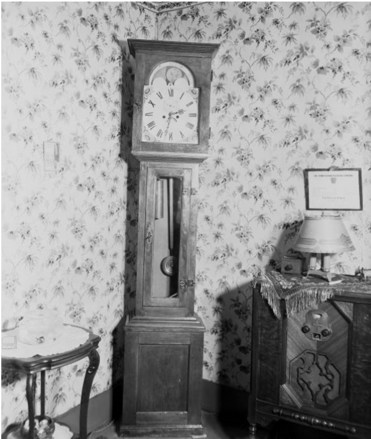
Longcase Clock and Radio, ca. 1930s