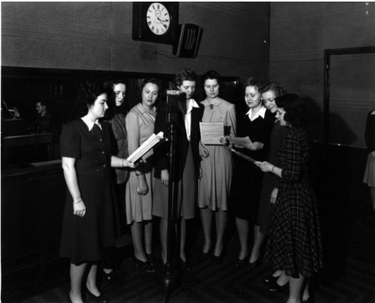
St. Mary's Group at W.B.O.W., 1942