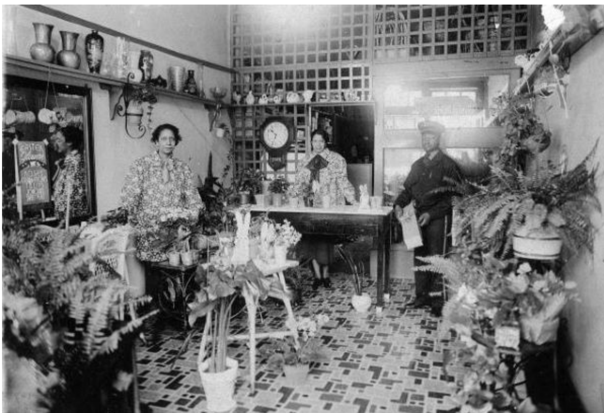
Atkins Flower Shop, n.d.