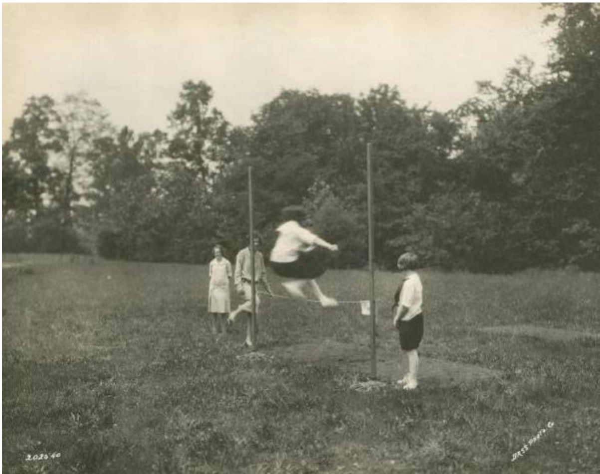
Ladywood High School, gym class, track and field, high jump, 1927