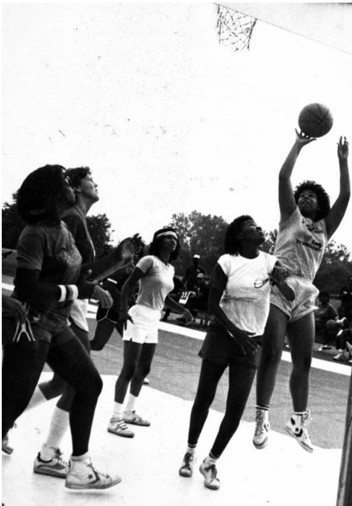
CC Express vs Atterbury JC, 1984