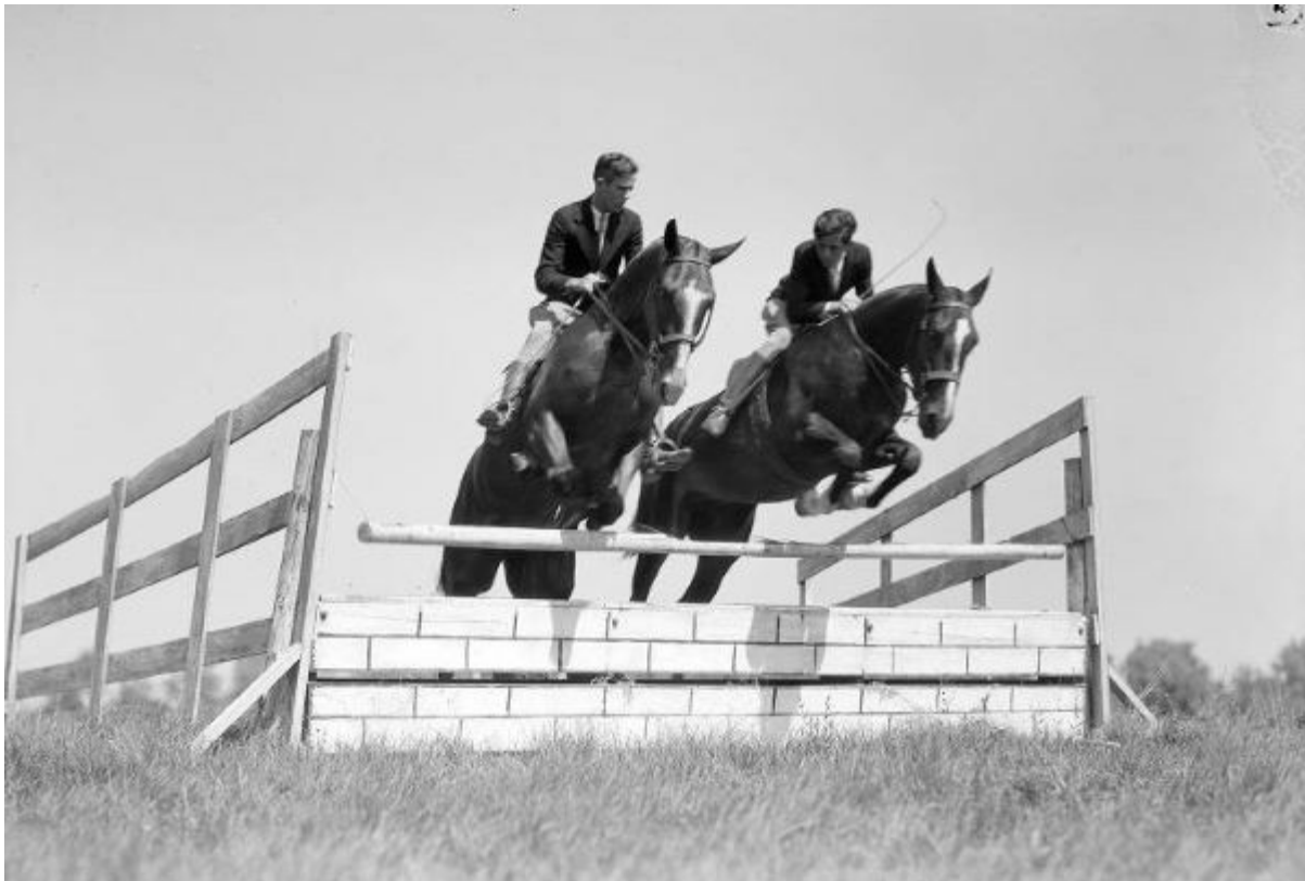
Champion Show Horses at the 1931 Indiana State Fair, 1931