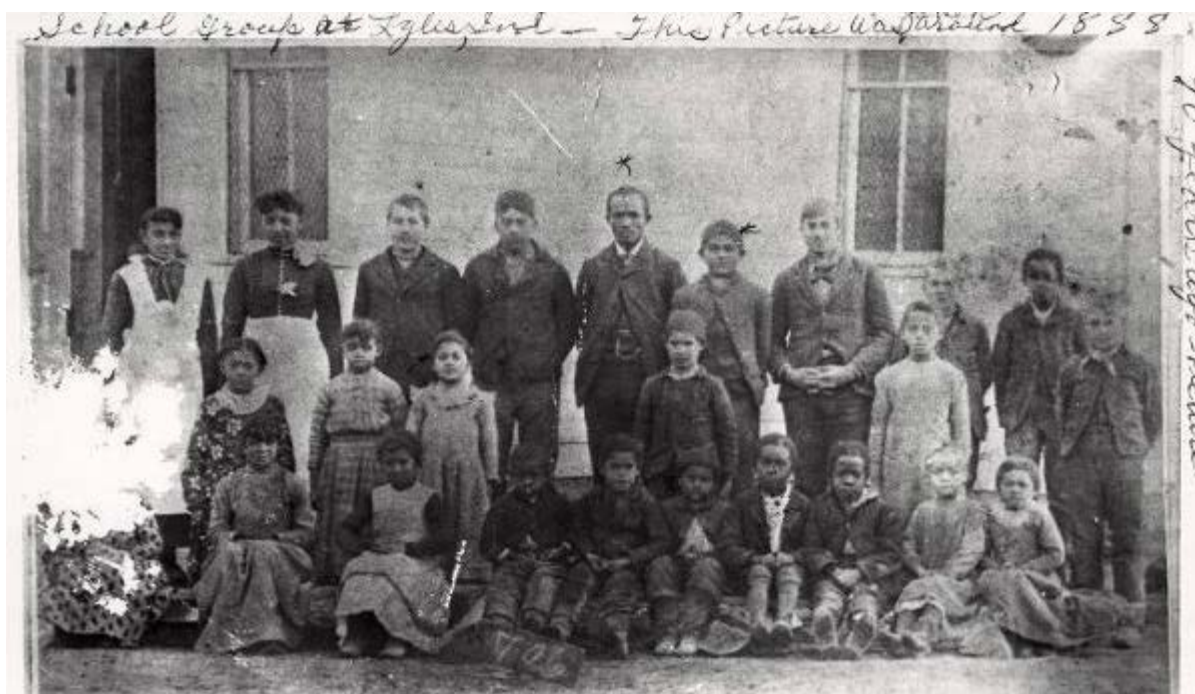
Lyles Station School, 1888