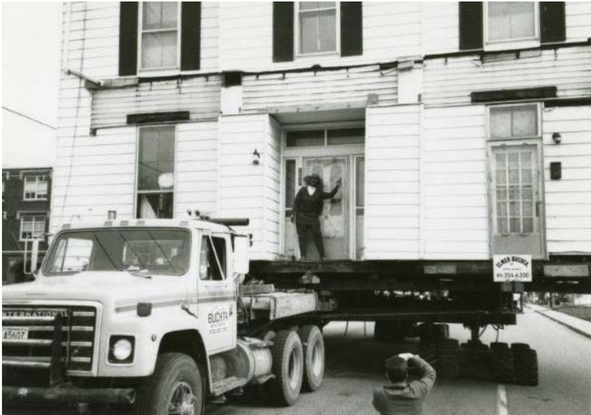
Moving of the Heritage Learning Center, 1994