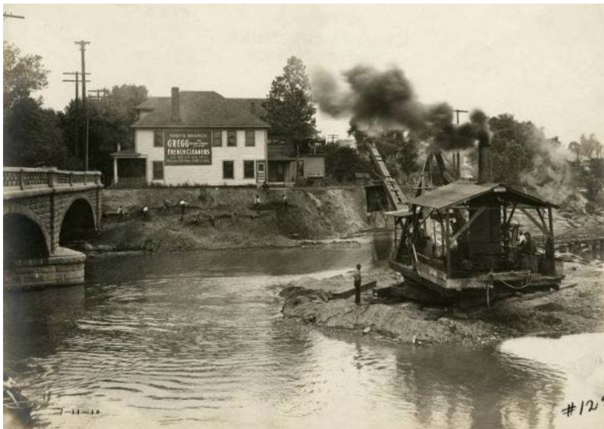
Fall Creek, North Bank, 1910