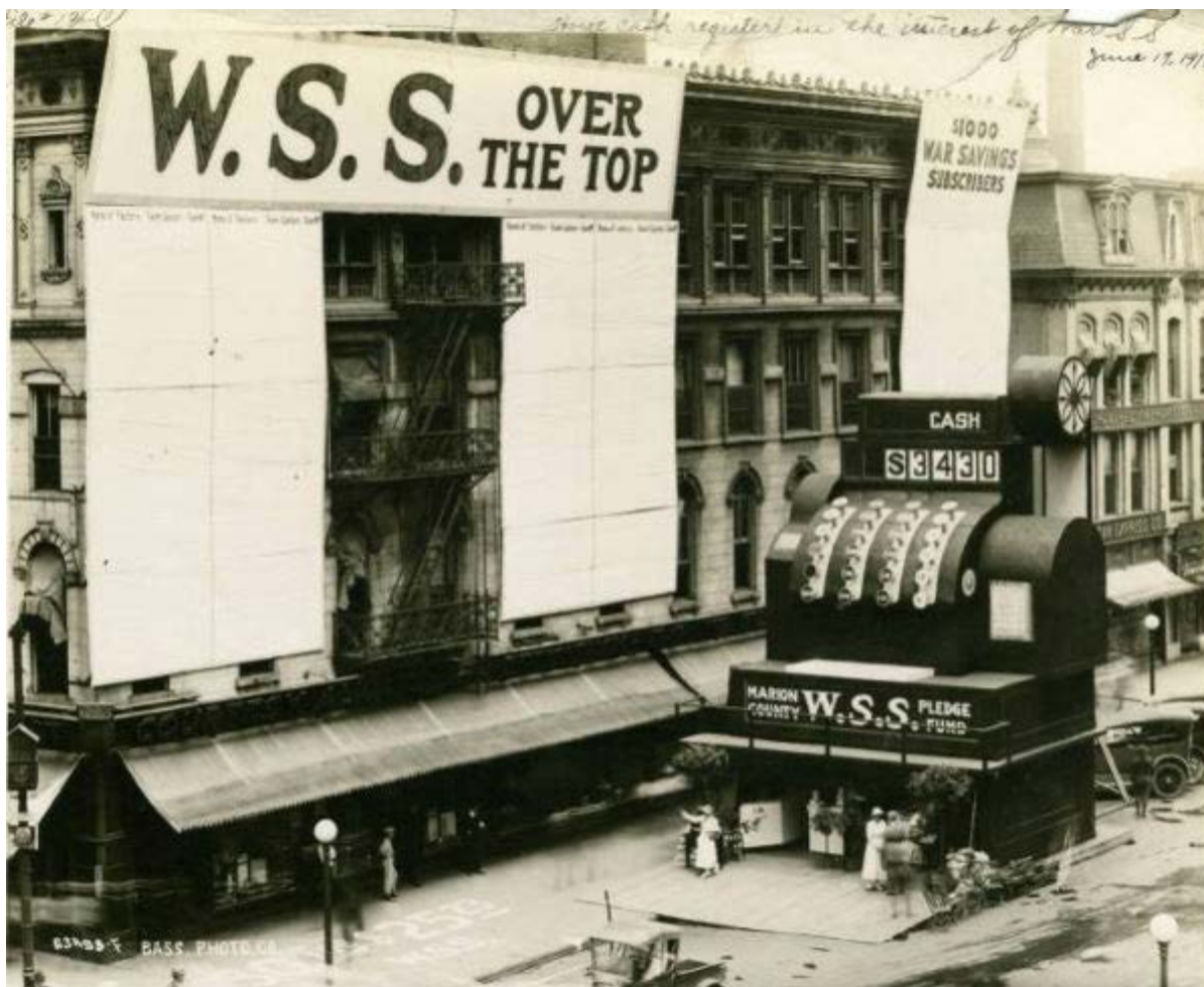
Giant cash register, war savings campaign, Monument Circle, 1918