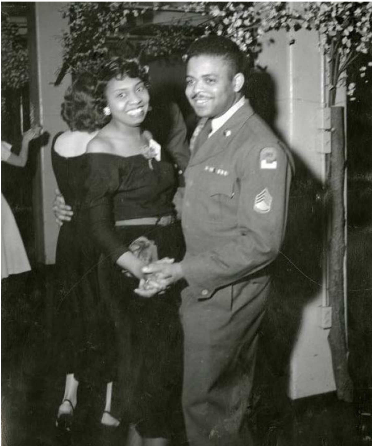
Dancing at the SMC. ca. 1957