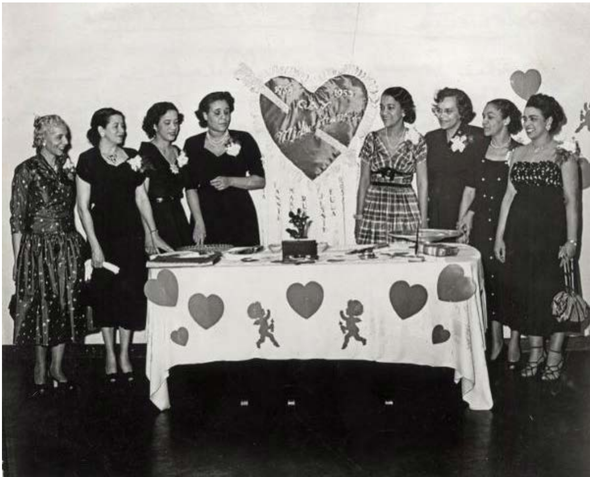
Midwestern Bridge Club Valentines Day Event, 1953