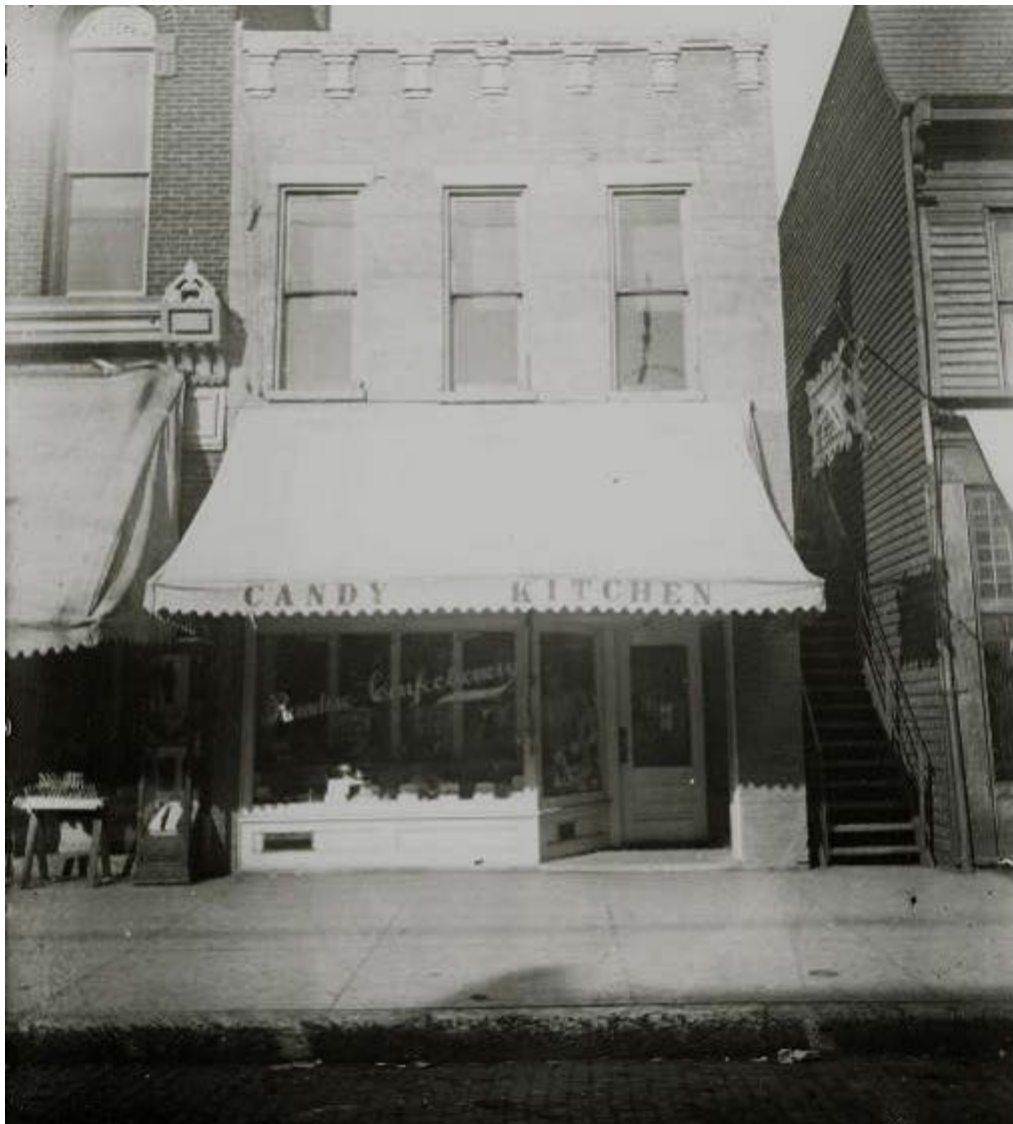
Smalls Candy Kitchen, ca. 1900