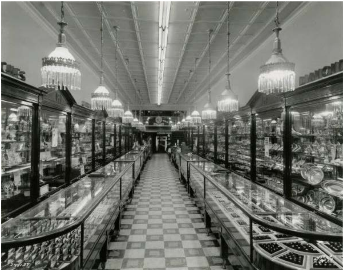
Rost Jewelers, interior, 1941