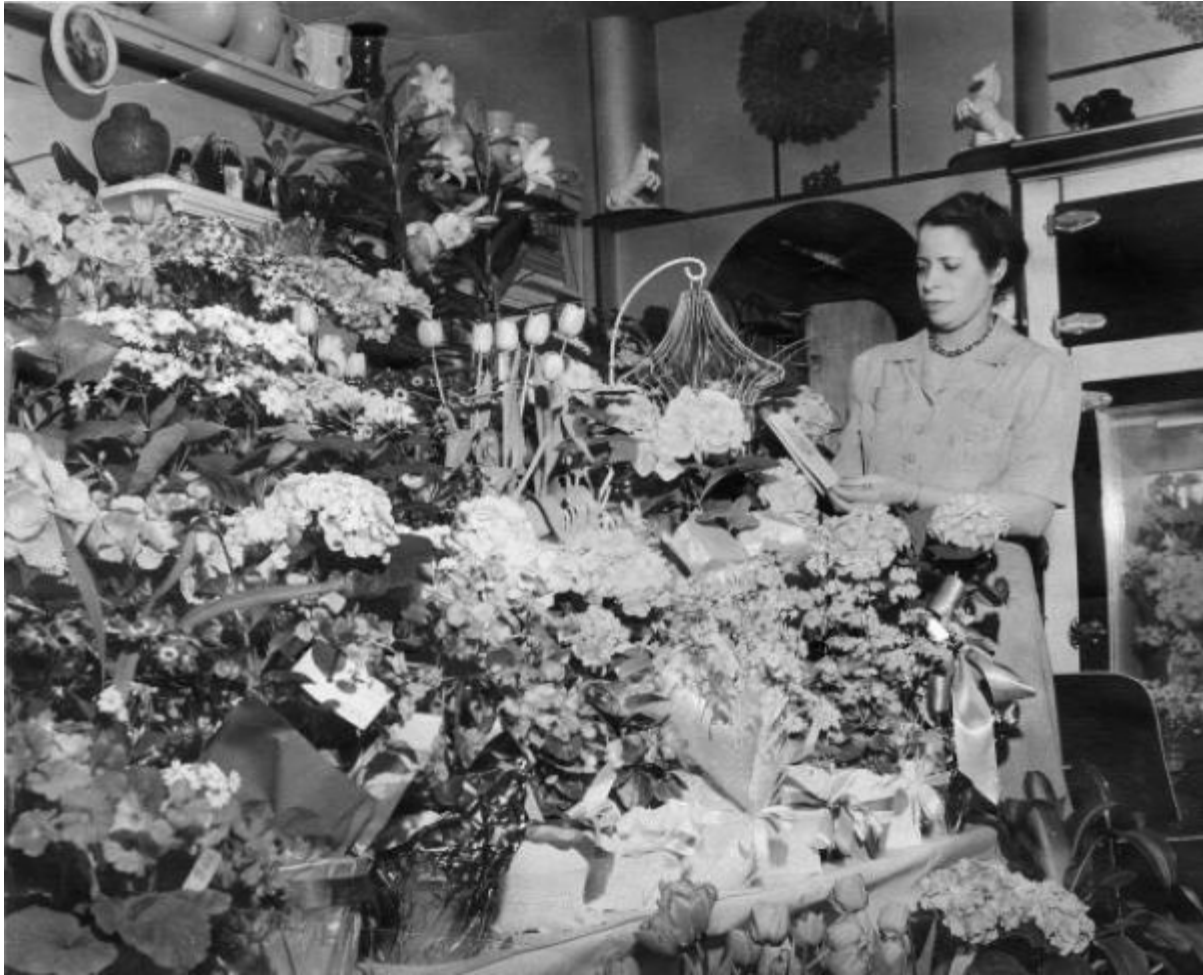
Atkins Flower Shop, 1928