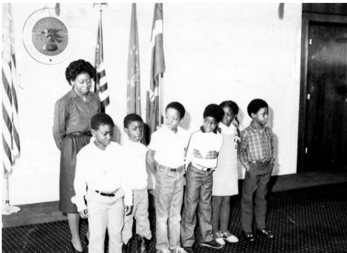
Black History Observance, 1984