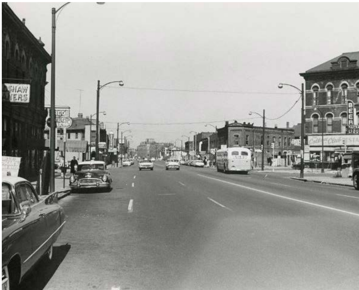
300 Block of Indiana Avenue Looking Northwest, ca. 1950s-60s