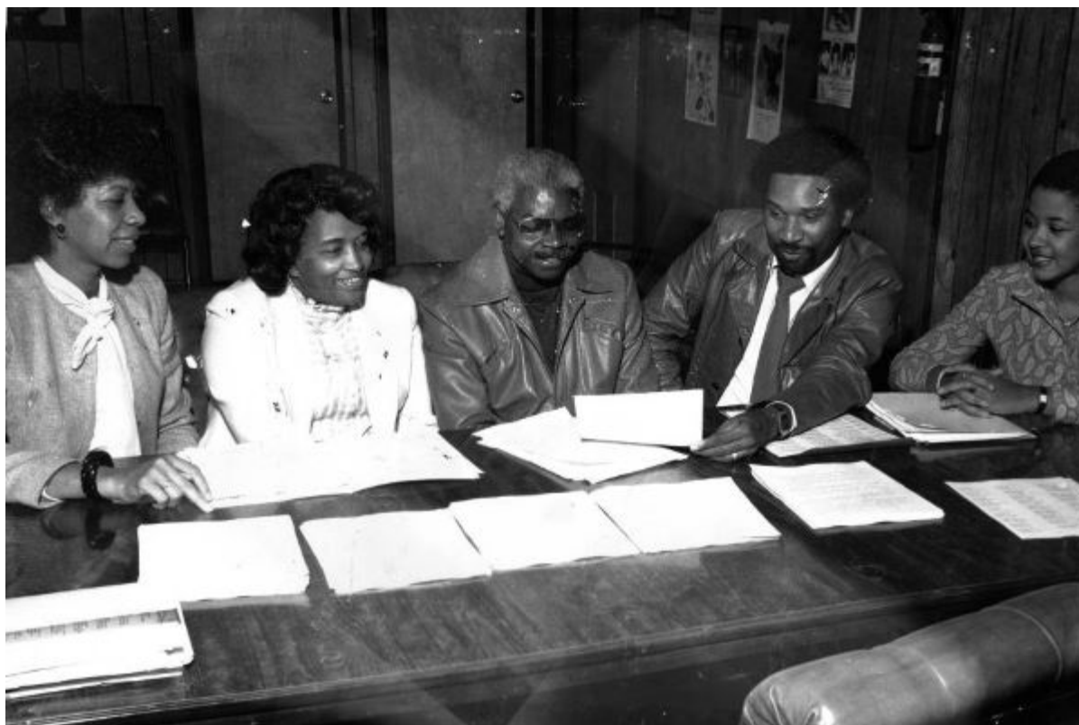
Prepare for 'Black History Month'. 1983