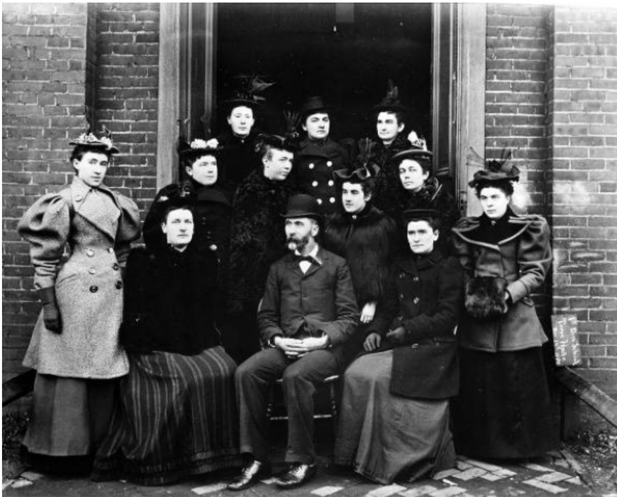
Teachers 2nd District School, Terre Haute, Indiana, ca. 1895