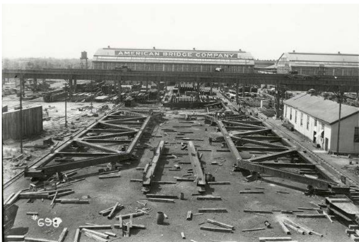
Bridge Trusses in Yard of Gary American Bridge Company Plant, ca. 1918