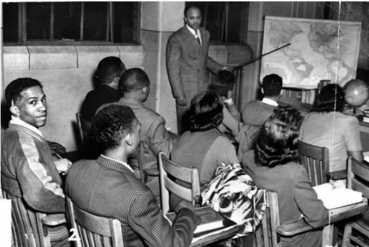
Classroom at Crispus Attucks High School, 1948