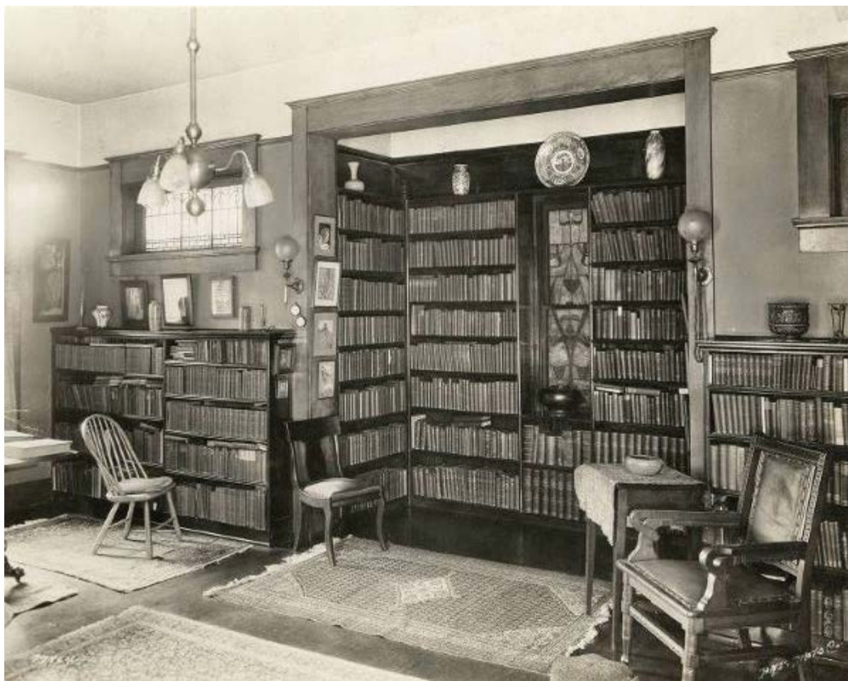
Nicholson Home. Interior. 1926