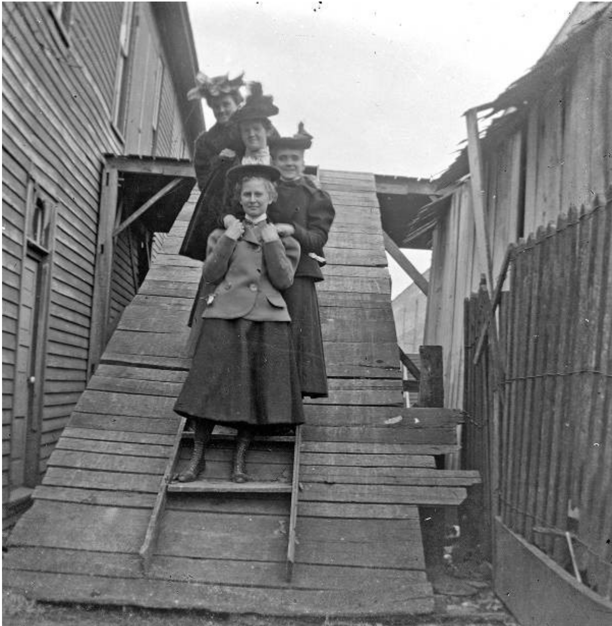
Four Young Women on a Ramp Behind the Lane Home, ca. 1900