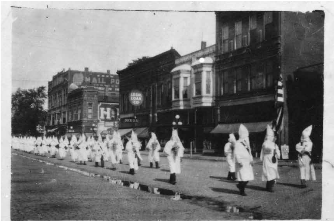
1924 Hartford City, Indiana