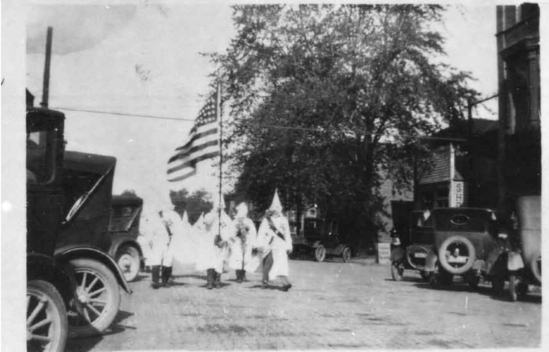
"Klan Parade," 1924