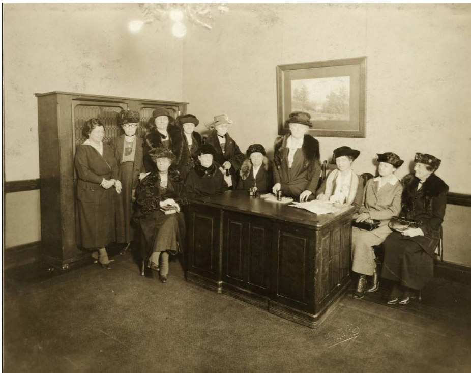
Propylaeum Board, 1922.

Feb. 9 - Northeast Document Conservation Center webinar.