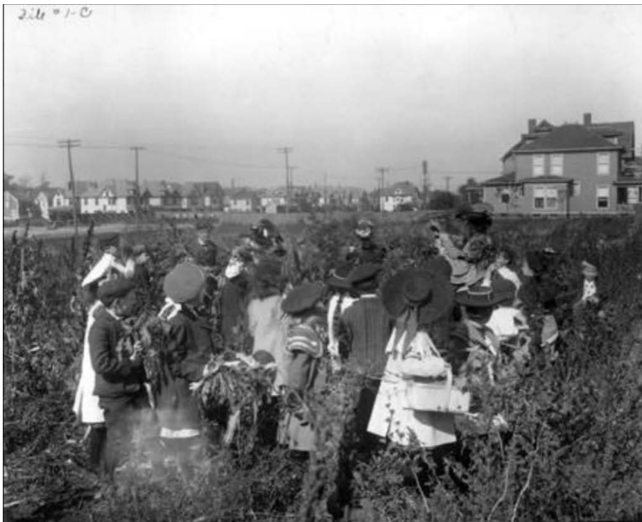
Schoolchildren in field collecting plants, 1903 (Bass Photo Co Collection, Indiana Historical Society).

Curious about capturing a surprising moment for the future: Check out: