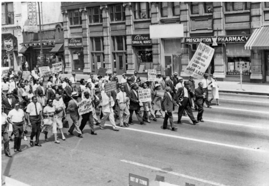
NAACP Freedom Rally March

It can take a bit of time to get used to determining what is a structural and what is a cosmetic issue. Just remember to look closely at an item and really think about how the item was constructed and where those points of stress (like seams, folds, and joints) naturally are. Try to think about whether or not the condition issue is near one of these points, or creates a new point of stress, or if it is simply that the item does not look as good as it did the day it was created. Wanting historical objects to look perfect is a difficult thing to achieve, because their imperfections often result from their history and what makes them special.