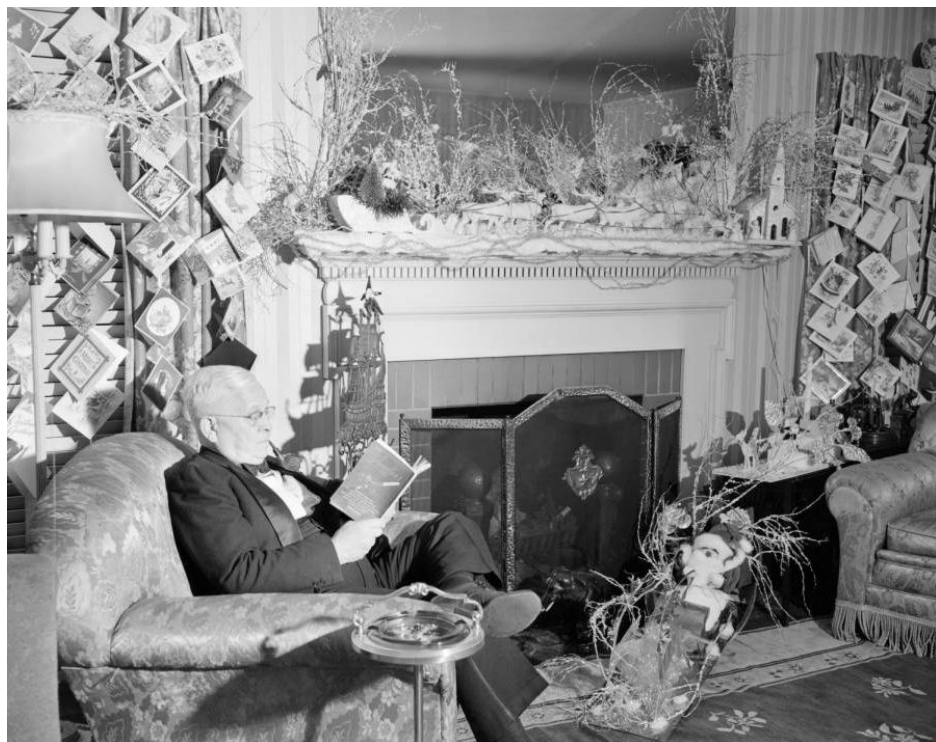
Christmas Card Display in Living Room.

come out of the chimney with Santa. If the card is dirty, make sure to clean it before storing it away properly in an acid free box. (See: Collections Advisor Issue 97 )