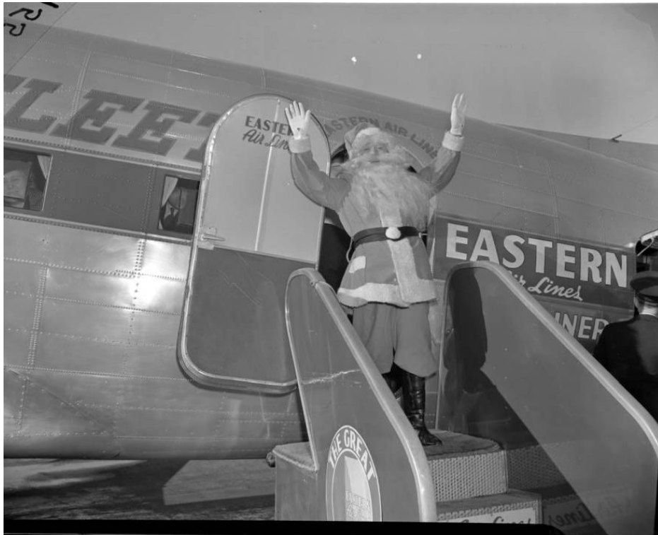
Santa Claus at Block's.

As we look ahead to the New Year we also look back on all of the wonderful time we spent during the holiday season. And now, it is time to pack up and store away all the lovely things until next holiday season.