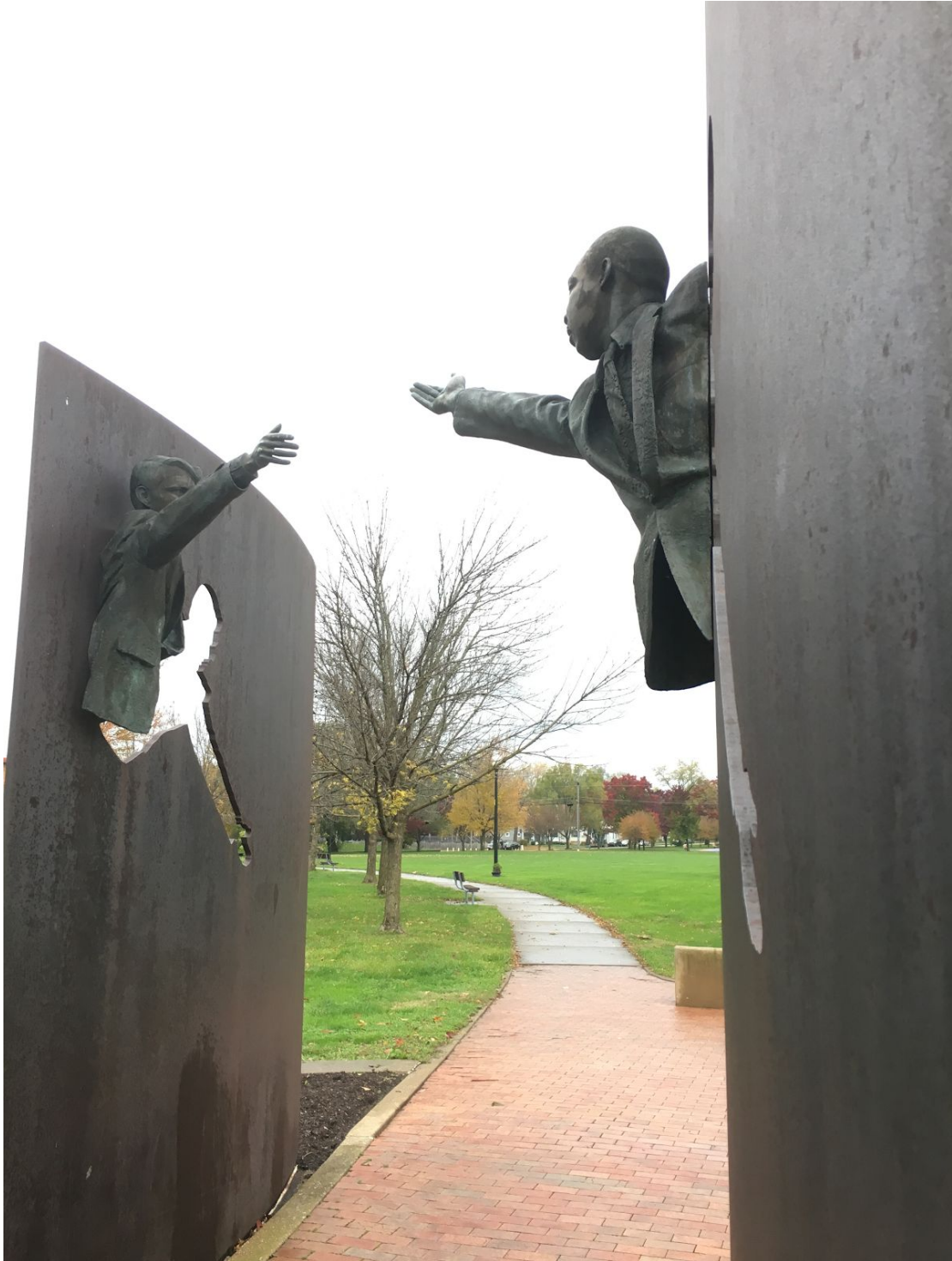
The Landmark for Peace in Indianapolis, where Robert Kennedy gave his heartfelt speech