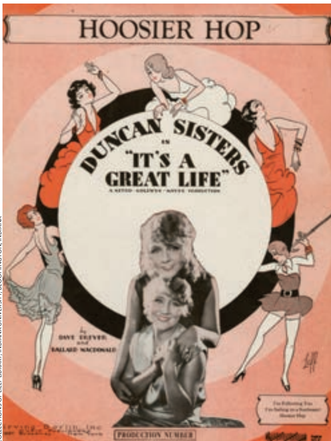
COLLECTIONS OF LULLY LIBRARY, INDIANA UNIVERSITY, BLOOMINGTON, INDIANA

Sheet music for the song “Hoosier Hop.” The song was used in the 1929 film It’s a Great Life , showing that the new styles of music and dancing had caught on in Indiana. As the lyrics go, “It’s a hick step, but a slick step called the Hoosier Hop. It’s the high school kids invented the thing, grown up folks caught onto the swing.”