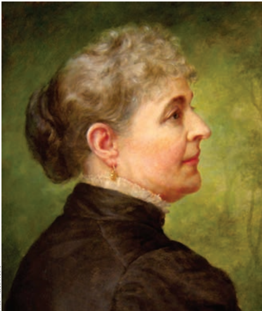
Caroline Scott Harrison