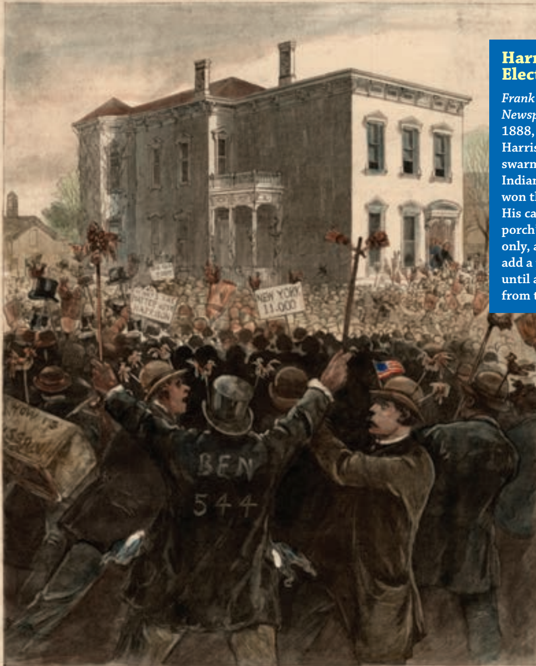
THE LATE ELECTION.—POPULAR DEMONSTRATION AT THE RESIDENCE OF GENERAL HARRISON, IN INDIANAPOLIS, IN HONOR OF HIS ELECTION TO THE PRESIDENCY.

FROM A DESIGN BY FRANK LESLIE—SEE PAGE 212.