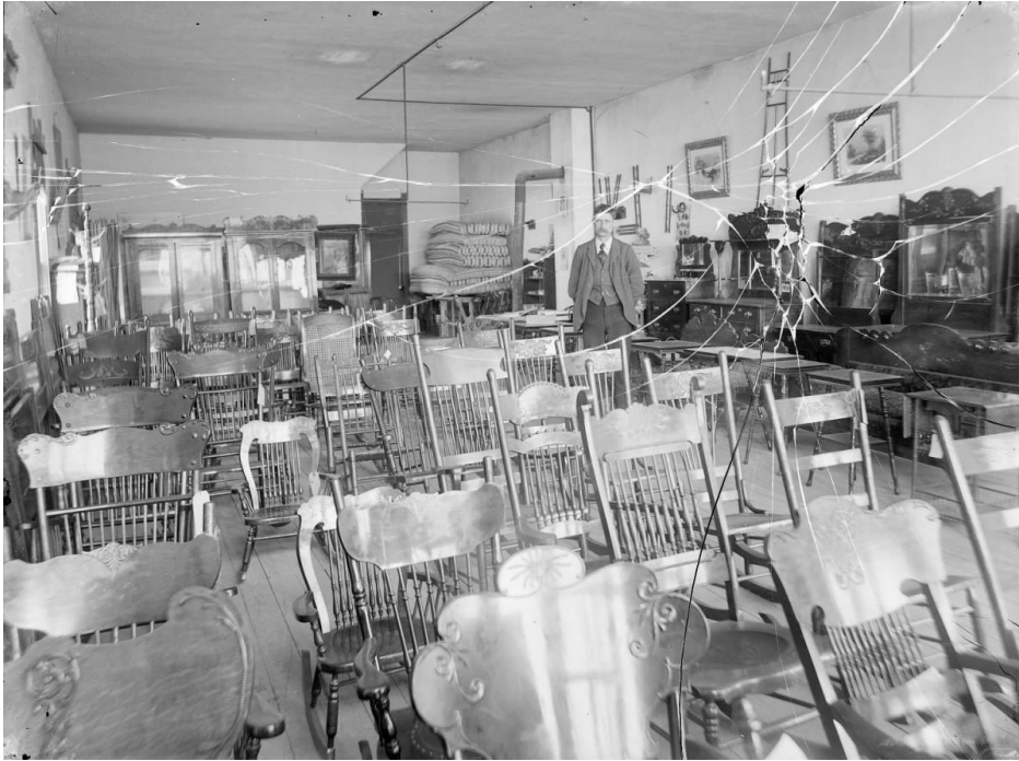
Furniture Store Interior .

with China; even the story of the slaves on sugar plantations. The catalyst to all these stories becomes the most important use of the sugar canister. We prioritize its wellbeing above "traditional" usefulness. We realign its usefulness with its new role as a museum object rather than a daily houseware.