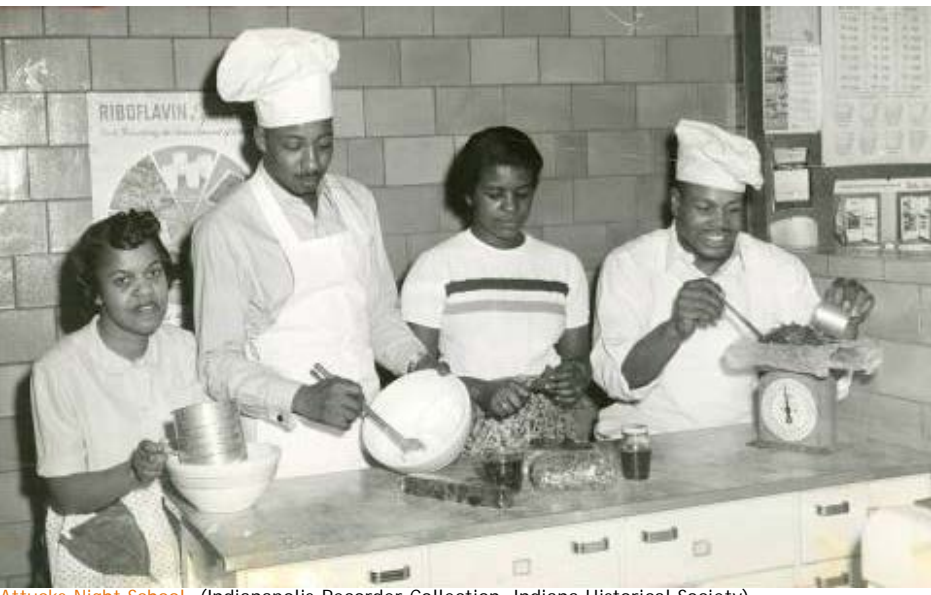
Attucks Night School.

Although it might be one of the least exciting things we do in museums, cataloguing collection items is one of the most important; and even less exciting than doing the cataloguing are the databases we employ to hold the information. Before we can begin adding information into those databases, we first have to consider setting some standards for their use. This does not necessarily just mean what we put into them, but also how we enter that information. This is increasingly important when more and more people add information to the database. Many hands may make light work, but too many cooks spoil the broth. Therefore, come up with a recipe of sorts, a set of standards, so each cook knows exactly what they should enter, where it should go, and how it should look.