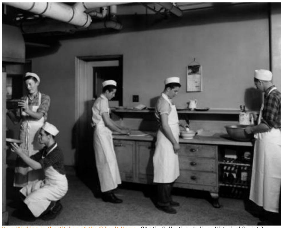
Boys Working in the Kitchen at the Gibault Home.

Even standardizing seemingly small things can help produce a clean, easy to understand database, especially if the database is used by researchers. Standardizing things like the use of full sentences versus a list of tag words in the description field is one way to create an easy to use database. When standardizing for ease of use, it is not about doing anything in a certain way, it is about doing it the same way every time so everyone knows where to find each piece of information.