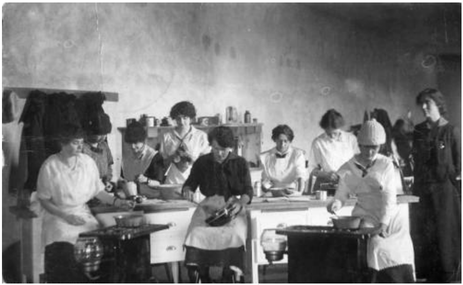
Cooking Class.