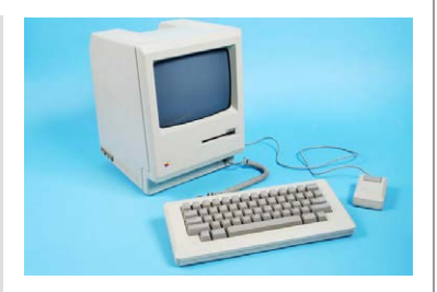
Apple Macintosh computer.